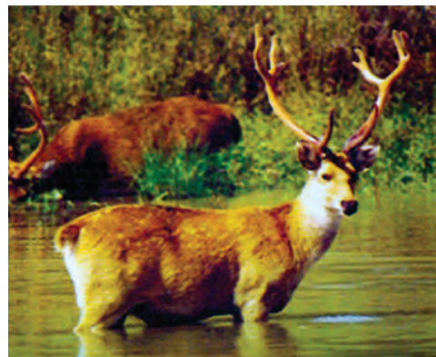
Fig. 7.6 : Barasingha

animals has become difficult because of disturbances in their natural habitat. Professor Ahmad tells them that in order to protect plants and animals strict rules are imposed in all National Parks. Human activities such as grazing, poaching, hunting, capturing of animals or collection of firewood, medicinal plants, etc. are not allowed