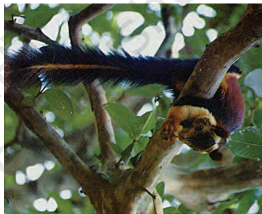
Fig. 7.3 (b) : Giant squirrel

endemic flora of the Pachmarhi Biosphere Reserve. Bison, Indian giant squirrel [Fig. 7.3 (b)] and flying squirrel are endemic fauna of this area. Professor Ahmad explains that the destruction of their habitat, increasing population and introduction of new species may affect the natural habitat of endemic species and endanger their existence.