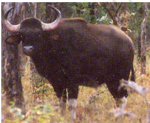
Fig. 7.5 : Wild buffalo

buffaloes (Fig. 7.5) and barasingha (Fig. 7.6) were also found in the Satpura National Park. Animals whose numbers are diminishing to a level that they might face extinction are known as the endangered animals . Boojho is reminded of the dinosaurs which became extinct a long time ago. Survival of some