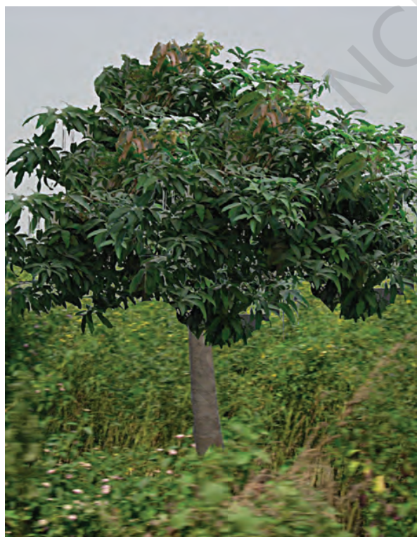
Fig. 7.3 (a) : Wild Mango

Madhavji shows sal and wild mango (Fig. 7.3 (a)) as two examples of the