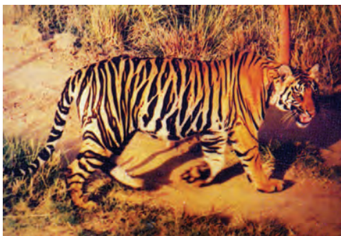
Fig. 7.4 : Tiger

Tiger (Fig. 7.4) is one of the many species which are slowly disappearing from our forests. But, the Satpura Tiger Reserve is unique in the sense that a significant increase in the population of tigers has been seen here. Once upon a time, animals like lions, elephants, wild