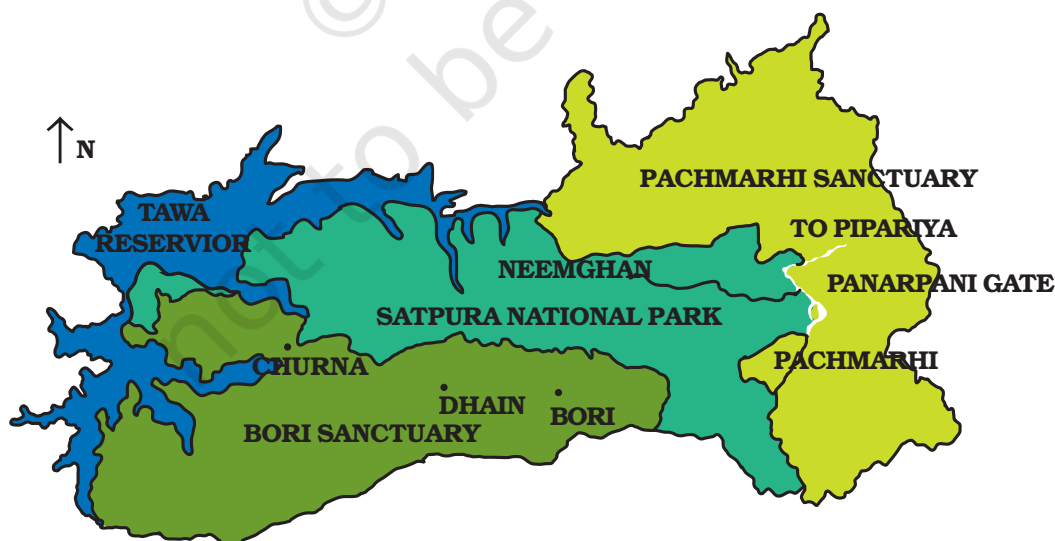
Fig. 7.1 : Pachmarhi Biosphere Reserve