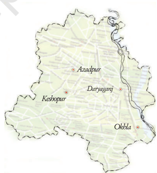
The above map of Delhi shows four of the 10 wholesale markets in the city.