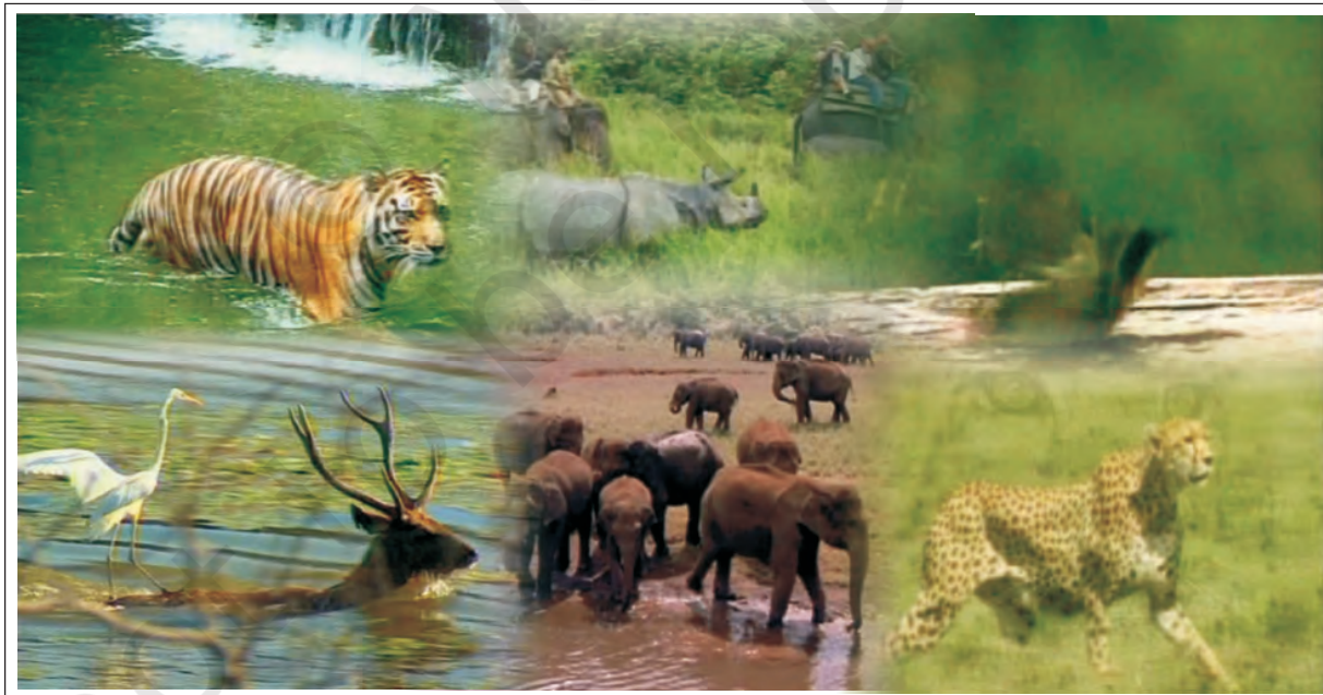
Figure 8.3 : Wildlife

In order to protect them many national parks, sanctuaries and biosphere reserves have been set up. The Government