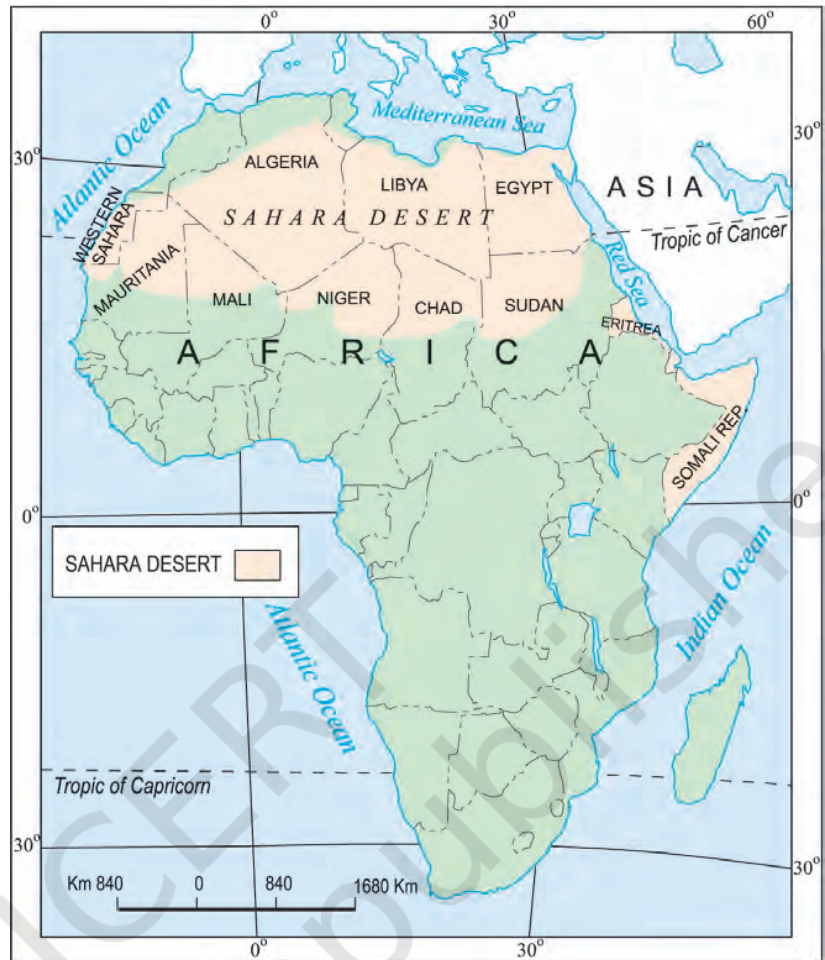
Fig. 9.2: Sahara in Africa

You will be surprised to know that present day Sahara once used to be a lush green plain. Cave paintings in Sahara desert show that there used to be rivers with crocodiles. Elephants, lions, giraffes, ostriches, sheep, cattle and goats were common animals. But the change in climate has changed it to a very hot and dry region.