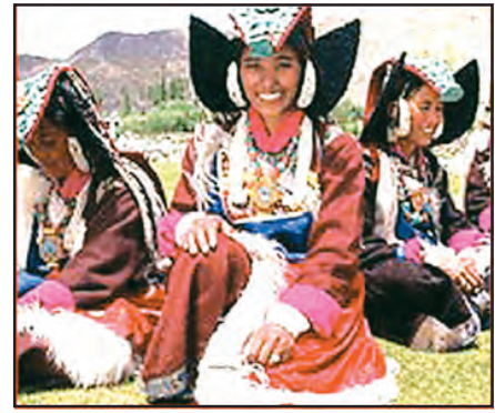
Fig. 9.6: Ladakhi Women in Traditional Dress

Life of people is undergoing change due to modernisation. But the people of Ladakh have over the centuries learned to live in balance and harmony with nature. Due to scarcity of resources like water and fuel, they are used with reverence and care. Nothing is discarded or wasted.