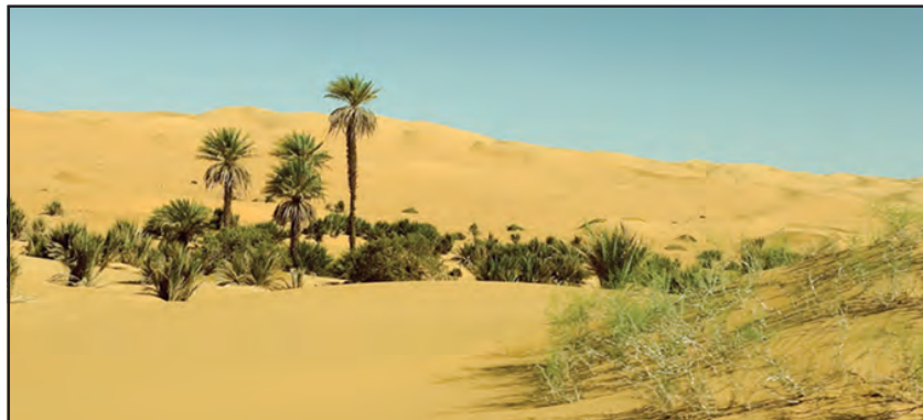
Fig. 9.3: Oasis in the Sahara Desert

snakes and lizards are the prominent animal species living there.