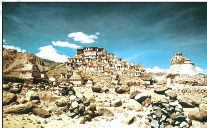
Fig. 9.5: Thiksey Monastery

The finest cricket bats are made from the wood of the willow trees.