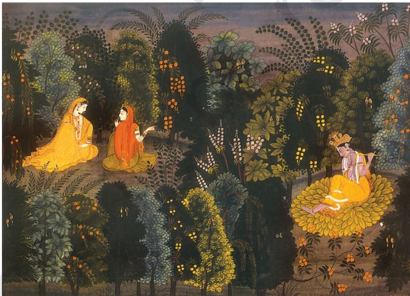
Fig. 9 Krishna, Radha and her companion, Pahari miniature, Kangra.

Pradesh. By the late seventeenth century this region had developed a bold and intense style of miniature painting called Basohli. The most popular text to be painted here was Bhanudatta's Rasamanjari . Nadir Shah's invasion and the conquest of Delhi in 1739 resulted in the migration of Mughal artists to the hills to escape the uncertainties of the plains. Here