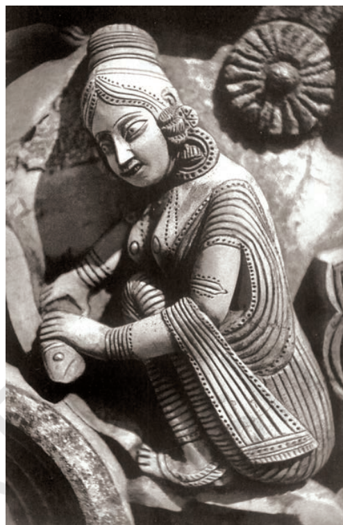
Fig. 14 Fish being dressed for domestic consumption, terracotta plaque from the Vishalakshi temple, Arambagh.

Brahmanas were not allowed to eat non-vegetarian food, but the popularity of fish in the local diet made the Brahmanical authorities relax this prohibition for the Bengal Brahmanas. The Brihaddharma Purana , a thirteenth-century Sanskrit text from Bengal, permitted the local Brahmanas to eat certain varieties of fish.