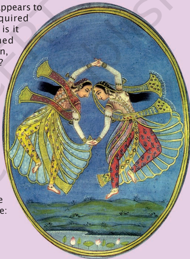
Fig. 6 Kathak dancers, a court painting.