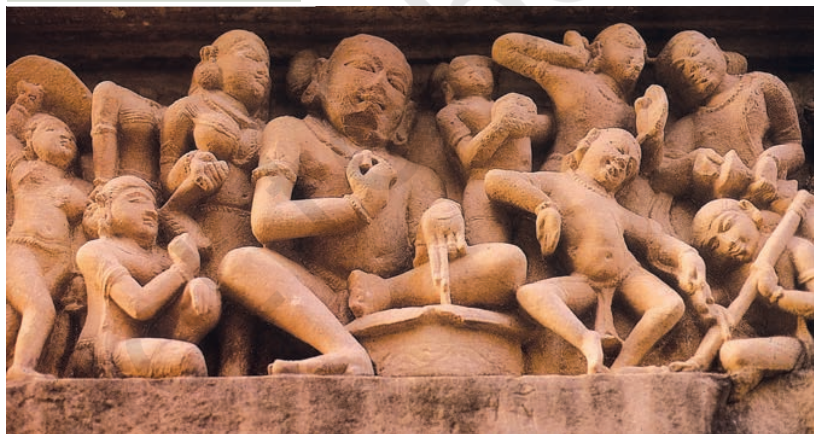
Fig. 5 Dance class, Lakshmana temple, Khajuraho.

of the nineteenth century it was firmly entrenched as a dance form not only in these two regions, but in the adjoining areas of present-day Punjab, Haryana, Jammu and Kashmir, Bihar and Madhya Pradesh. Emphasis was laid on intricate and