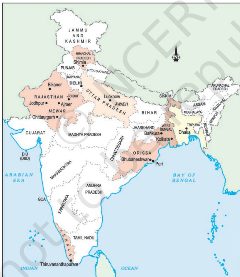
Map 1 Regions discussed in this chapter.

Did women find a place within these stories? Sometimes, they figure as the “cause” for conflicts, as men fought with one another to either “win” or “protect” women. Women are also depicted as following their heroic husbands in both life and death – there are stories about the practice of sati or the immolation of widows on the funeral pyre of their husbands. So those