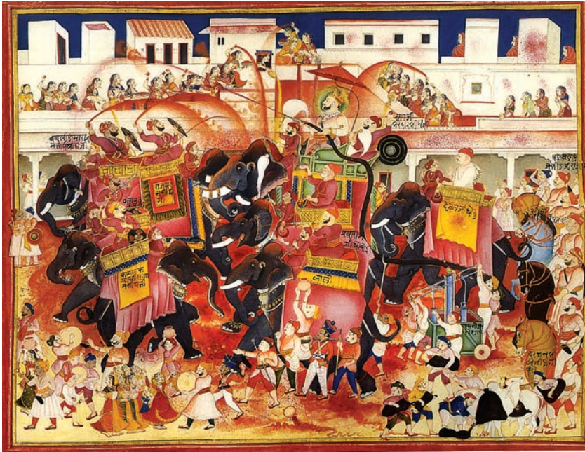
Fig. 8 Maharana Ram Singh II playing holi. Rajput miniature, Kota.

Pradesh. By the late seventeenth century this region had developed a bold and intense style of miniature painting called Basohli. The most popular text to be painted here was Bhanudatta's Rasamanjari . Nadir Shah's invasion and the conquest of Delhi in 1739 resulted in the migration of Mughal artists to the hills to escape the uncertainties of the plains. Here