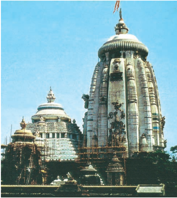
Fig. 3 Jagannatha temple, Puri.

As the temple gained in importance as a centre of pilgrimage, its authority in social and political matters also increased. All those who conquered Orissa, such as the Mughals, the Marathas and the English East India Company, attempted to gain control over the temple. They felt that this would make their rule acceptable to the local people.