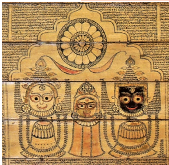
Fig. 2 The icons of Balabhadra, Subhadra and Jagannatha, palm-leaf manuscript, Orissa.

? Find out when the language(s) you speak at home were first used for writing.