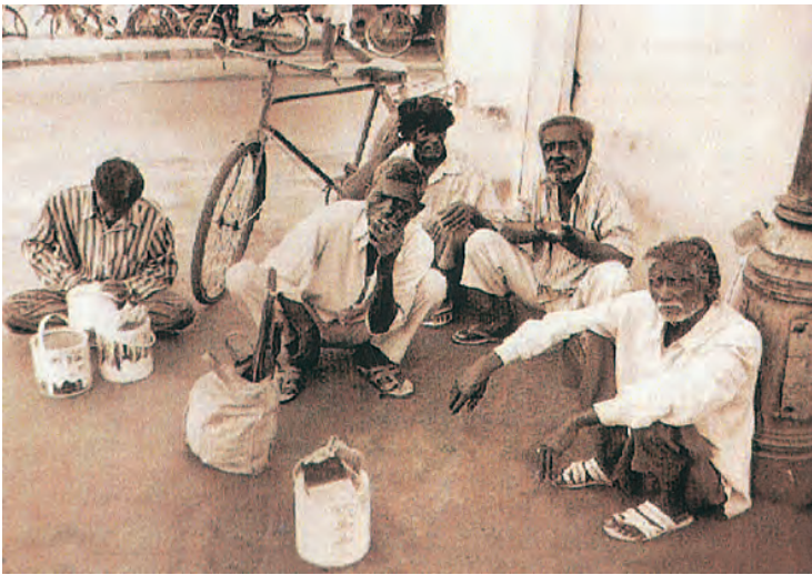
At labour chowk, daily wage workers wait with their tools for people to come and take them for work.

trucks in the market, dig pipelines and telephone cables and also build roads. There are thousands of such casual workers in the city.