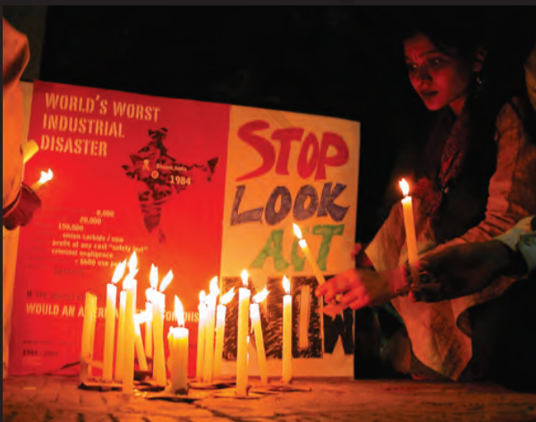
The struggle for justice goes on...

24 years later, people are still fighting for justice: for safe drinking water, for health-care facilities and jobs for the people poisoned by UC. They also demand that Anderson, the UC chairman who faces criminal charges, be prosecuted.