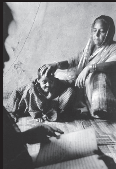
A child severely affected by the gas

Within three days, more than 8,000 people were dead. Hundreds of thousands were maimed.