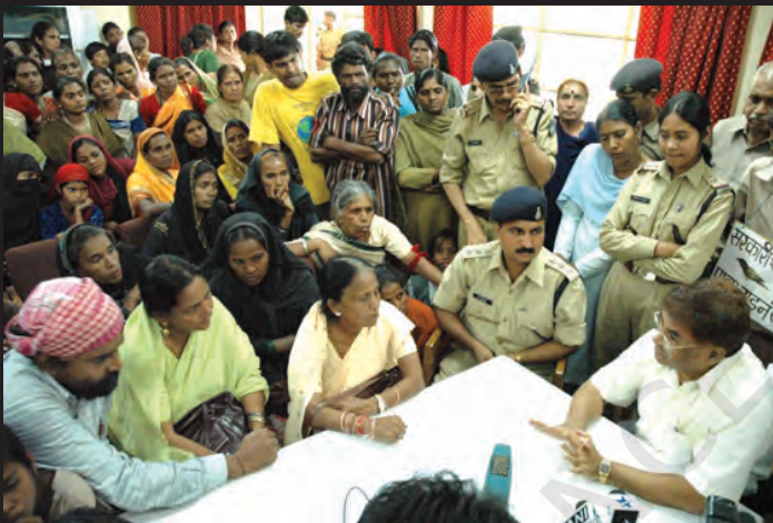
Gas victims with the Gas Relief Minister

Despite the overwhelming evidence pointing to UC as responsible for the disaster, it refused to accept responsibility.