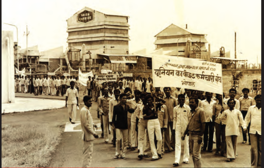
Members of UC Employees Union protesting

The disaster was not an accident. UC had deliberately ignored the essential safety measures in order to cut costs. Much before the Bhopal disaster, there had been incidents of gas leak killing a worker and injuring several.