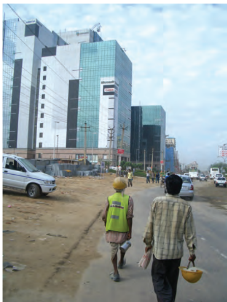
Accidents are common to construction sites. Yet, very often, safety equipment and other precautions are ignored.