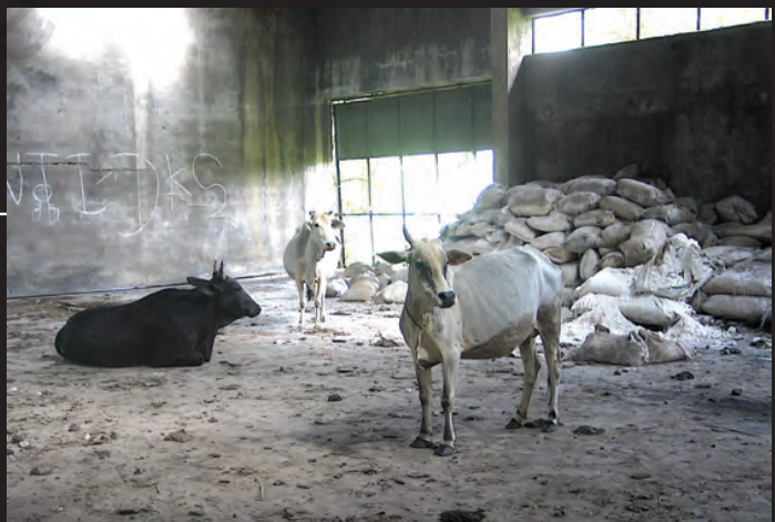
Bags of chemicals lie strewn around the UC plant

UC stopped its operations, but left behind tons of toxic chemicals. These have seeped into the ground, contaminating water. Dow Chemical, the company who now owns the plant, refuses to take responsibility for clean up.