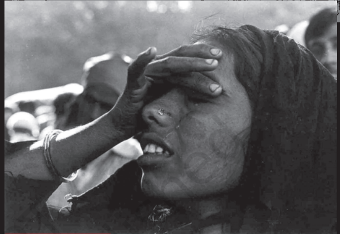
The next morning