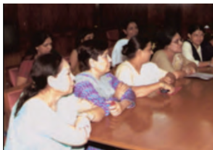
The above photo shows a few women Members of Parliament.

Why do you think there are so few women in Parliament? Discuss.