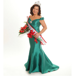
Ms. Senior America 2023