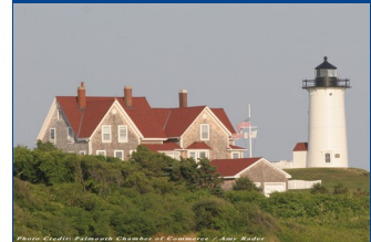
Lighthouse overlooking Vineyard Sound