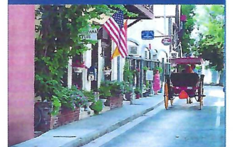
Historic St. George St