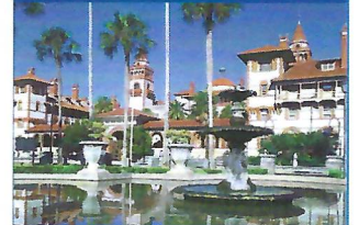
St. Augustine, our Nation's Oldest City

Day 7: After enjoying a Continental Breakfast, you will depart for home... a perfect time to chat with your friends about all the fun things you've done, the great sights you've seen and where your next group trip will take you!