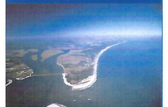
Aerial view of Amelia Island