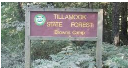
Browns Camp OHV