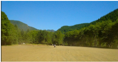
Diamond Mill OHV staging area