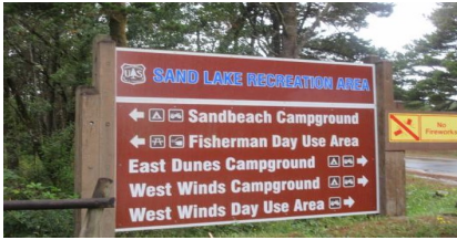
Sand Lake Recreational area