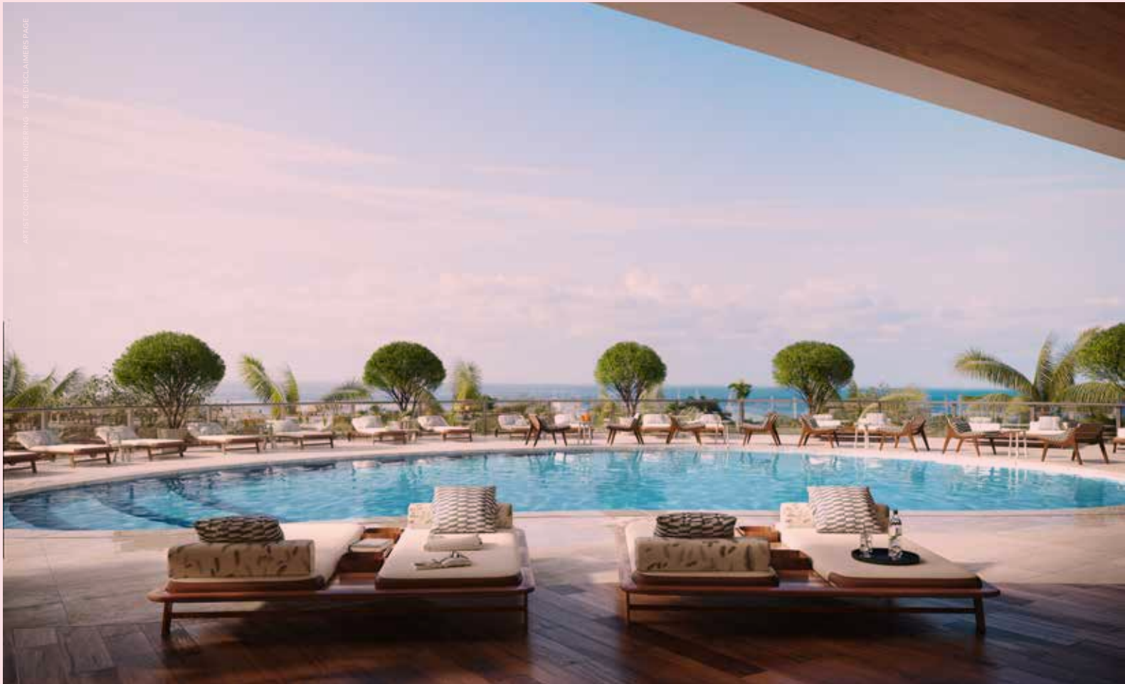
Bayshore Club Pool Deck

ARTIST CONCEPTUAL RENDERING - SEE DISCLAIMERS PAGE