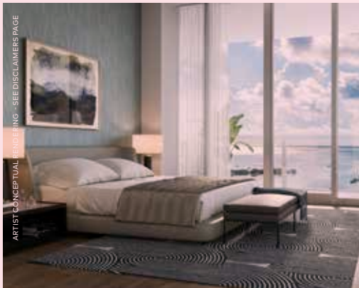
Bayshore Master Bedroom