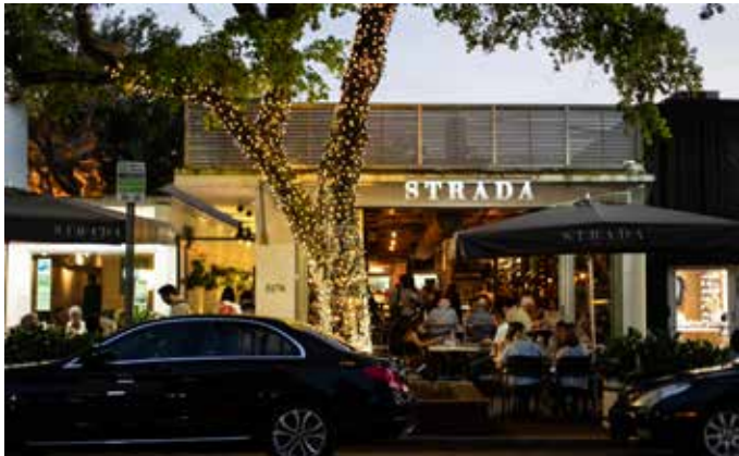
Strada in the Grove