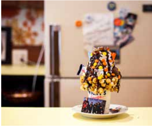
Vicky's House Milkshake Bar and Tasting Room