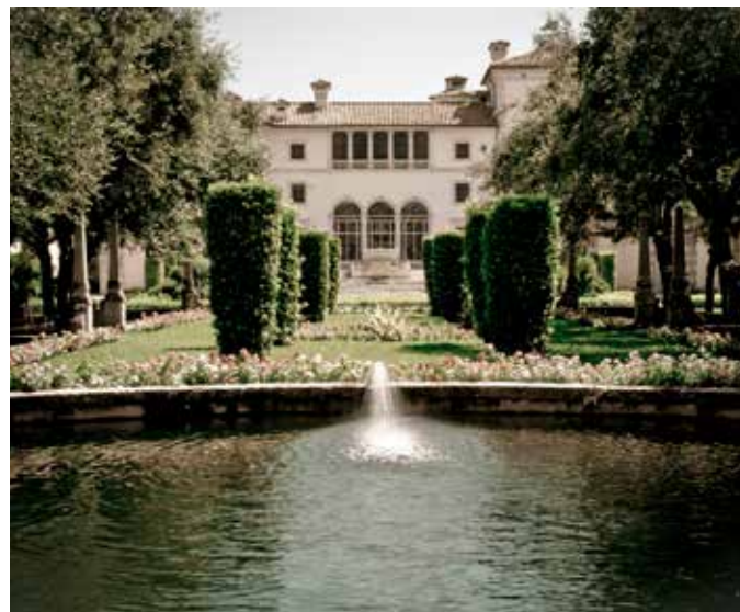
Vizcaya Museum and Gardens

Located on the northern end of Coconut Grove on Biscayne Bay, Vizcaya was the winter estate of manufacturing magnate James Deering, who spent the years between 1912 and 1922 constructing the building and furnishing it with antiquities and artifacts, particularly from Italy. Today, the site is open to the public for guided tours of the house and gardens, which include a stunning collection of native and exotic flora. Gray foxes live on and around the property, so keep your eyes open for them.