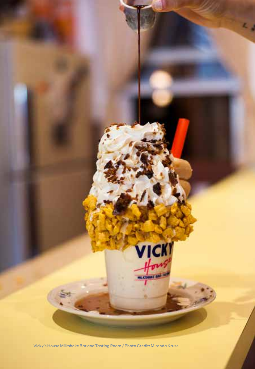
Vicky's House Milkshake Bar and Tasting Room