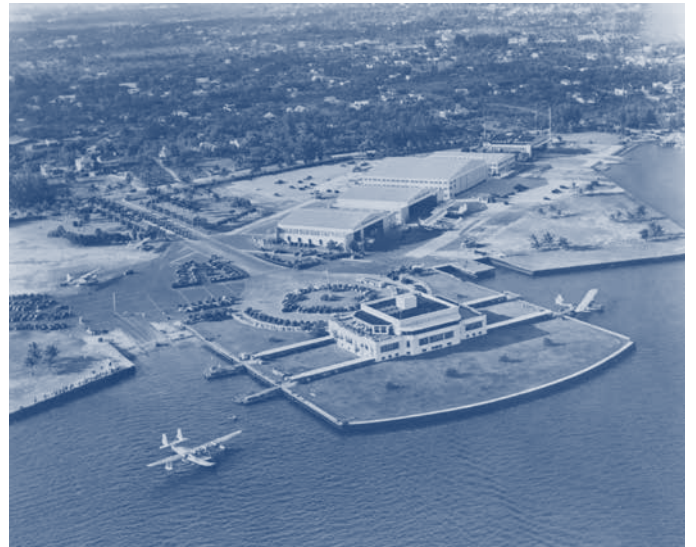
1930s Aerial View. Coconut Grove, Florida.