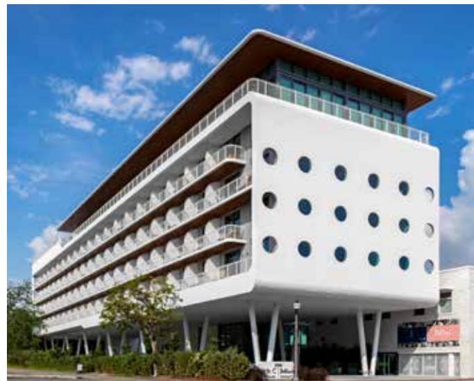
Mr. C Hotel