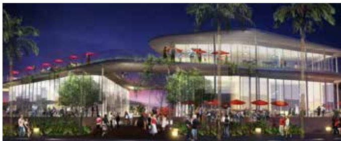
Regatta Harbour - Artistic Rendering

Located on Dinner Key, Regatta Harbour maintains the historic site's reputation as a boater's paradise while offering plenty for people who can't tell a skiff from a schooner. Sitting on Biscayne Bay and adjoining Regatta Park, the property features 55,000 square feet of retail space, a bayside pedestrian walkway, three waterfront restaurants and a live-music venue. The restaurants appeal to a variety of tastes, specializing in seafood (Afishonada), steak (Cut + Dry) and pub food (Hangar 42). Floating docks and finger piers welcome visiting boaters, and Regatta Harbour provides staging areas, a fueling facility, dry storage and a boat launch.