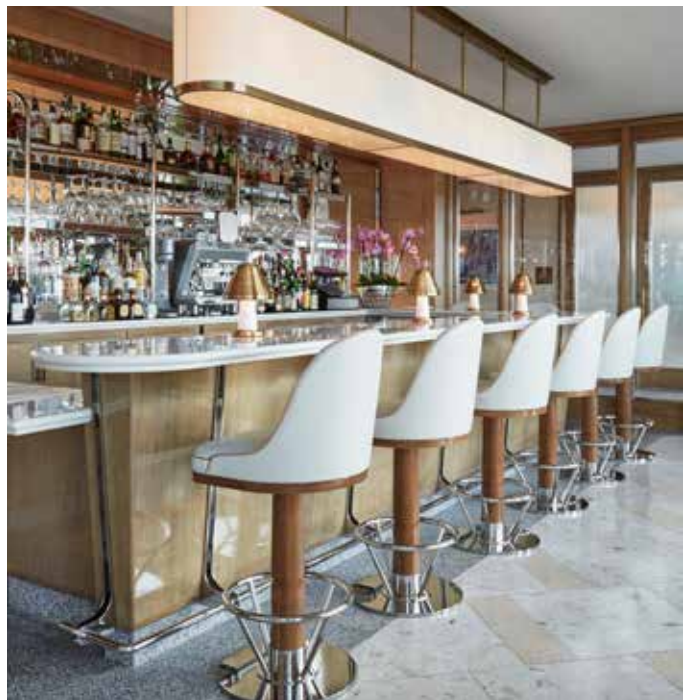
Bellini at Mr. C Hotel