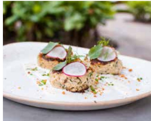
Glass & Vine