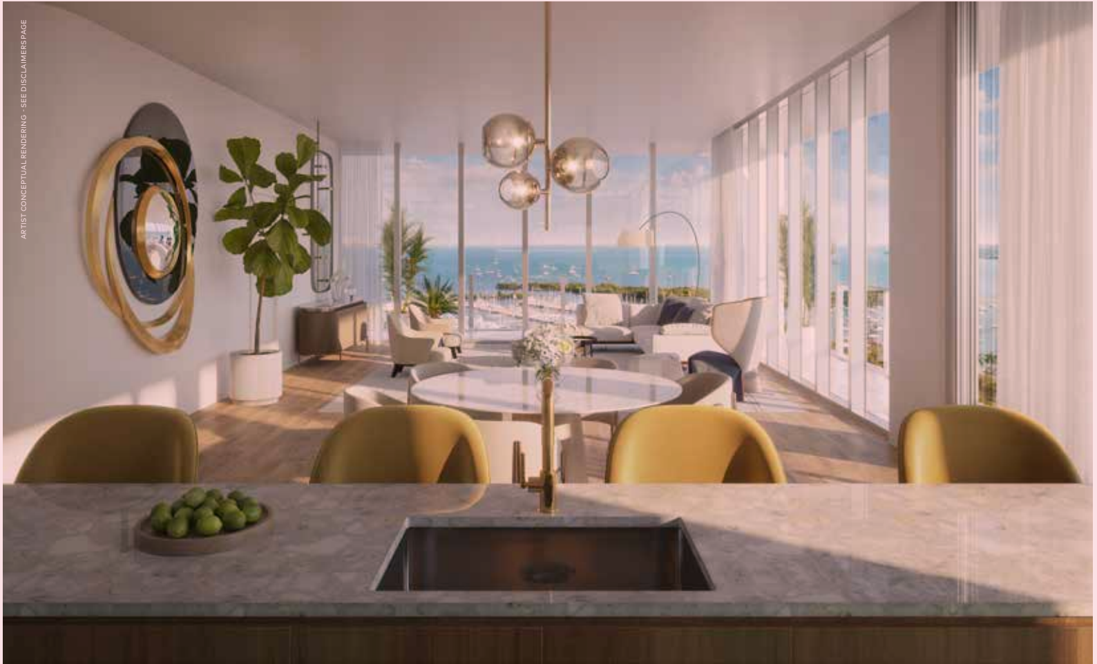
Bayshore Living Room

ARTIST CONCEPTUAL RENDERING - SEE DISCLAIMERS PAGE