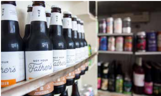
Vicky's House Milkshake Bar and Tasting Room