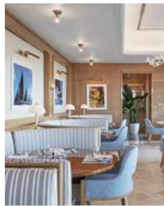
Mr. C Hotel