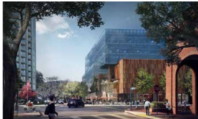
Mary Street Artistic Rendering