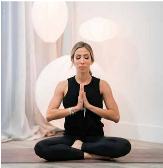
Buddha Grove Yoga

Offering more than 30 classes a week, this studio caters to yoga beginners and experts alike. Sessions range from intense and calorie-burning to meditative and restorative. The studio offers monthly memberships and private introductory classes.