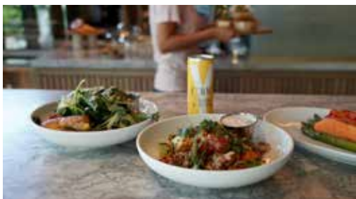
Tigertail + Mary

Part of the hospitality group that owns Farinelli 1937 and La Rue Bistronomie, Strada is a sophisticated but inviting Italian eatery whose menu offers a large selection of pastas, seafood, crudos and antipasti. The rustic interior makes for a nice place to enjoy brunch, which the restaurant offers 10:30 a.m.-2 p.m. Sundays.