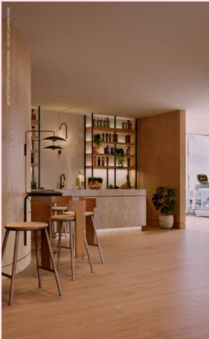
Bayshore Club Juice Bar