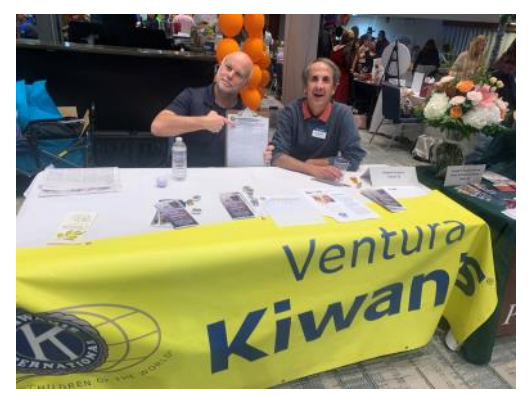
Ventura Kiwanis staffed a table at the Ventura Chamber Fall Expo.