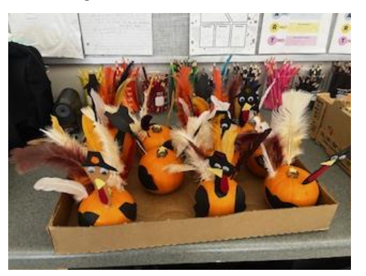
The DATA Builders Club is making 50 turkeys out of small pumpkins, feathers, and other craft items to be used by the Salvation Army during its thanksgiving meals.