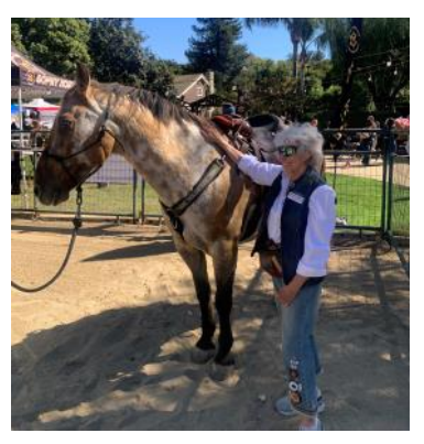
Ventura Kiwanis participated in the 2nd birthday celebration for Sonny Horses 4 Kids.