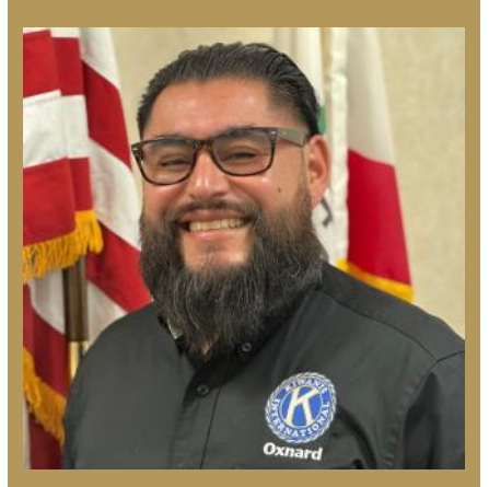
Cuauhtemoc Solorio Lieutenant Governor