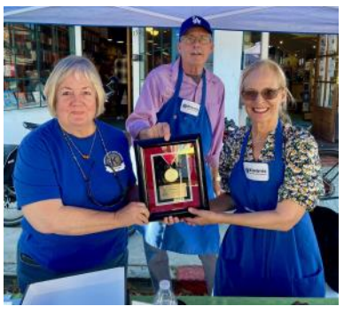
November 3rd was the grand re-opening of the Santa Barbara Michael Towbes Plaza at the Downtown Public Library. Kiwanis and all the service club donors were invited to show off their clubs. It was a great day, and we talked about our Kiwanis Club to 100's of people, including showing off a beautiful plaque from Special Olympics Santa Barbara.