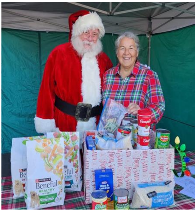
On Saturday, Nov. 16, we held a Food Drive for the Salvation Army. We were at the Vons on Harbor from 10-1 pm. Our invited guest was the man in red, himself, Santa. It was a great day, and we collected about 50 lbs. of canned and dried goods, plus we also collected cash. It was a great day.