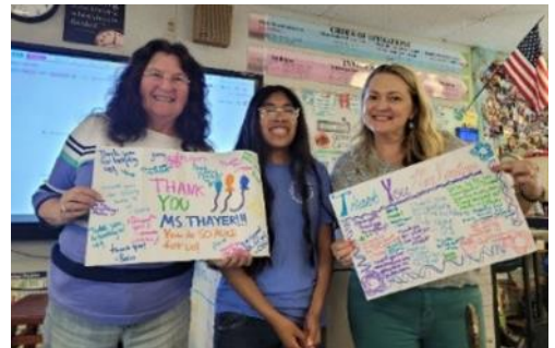
Builders Club last meeting