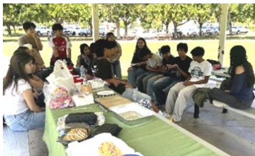
KIWIN'S Banquet and Awards