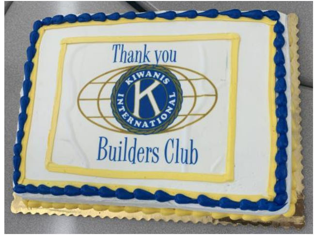
The Ventura Kiwanis DATA Builders Club celebrated its last meeting after a very active and successful year.