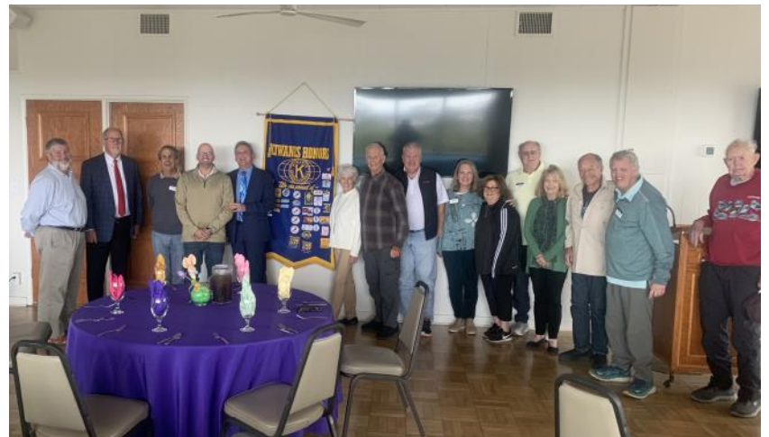
Ventura Kiwanis Club enjoyed an insightful program by members of the Ventura County Civil Grand Jury.