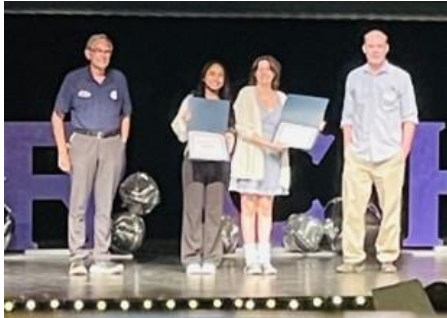
Scholarships at Rancho Campana and Adolfo Camarillo High Schools