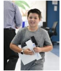
Moorpark has TERRIFIC Kids and TERRIFIC volunteers!