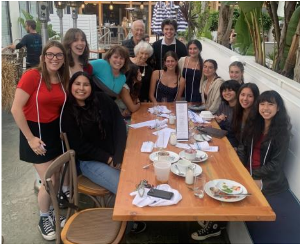
Ventura Kiwanis attended the "year-bookend" dinner for the incoming and outgoing officers of the Ventura High Key Club.