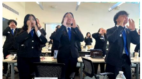
Did someone say, "KIWIN'S, how do you feel?"