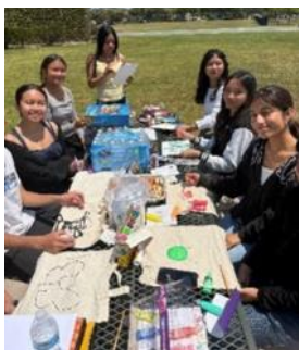
Key Club DCM