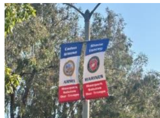
Moorpark Kiwanis runs the Military Banner program, and we just had new banners installed!