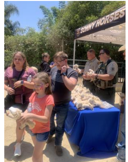
Recently Ventura Kiwanis established a relationship with the Autism Society of Ventura County to enhance the mission of both organizations. These photos are of a day with the Sheriff's Department at Sonny Horses 4 Kids.