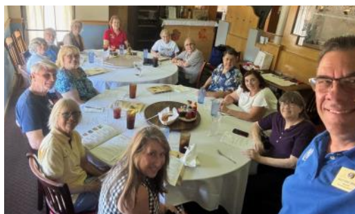
Moorpark joined Santa Susana for an Interclub.