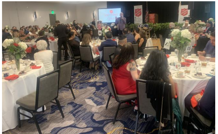
Ventura Kiwanis became a table sponsor and participated in the Ventura Salvation Army's Annual Gala fundraiser.