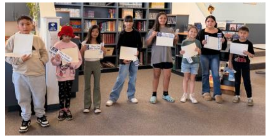
Each recipient receives a pencil, bumper sticker, book mark, and certificate. Parents are invited to each assembly, and every student gets individual recognition.