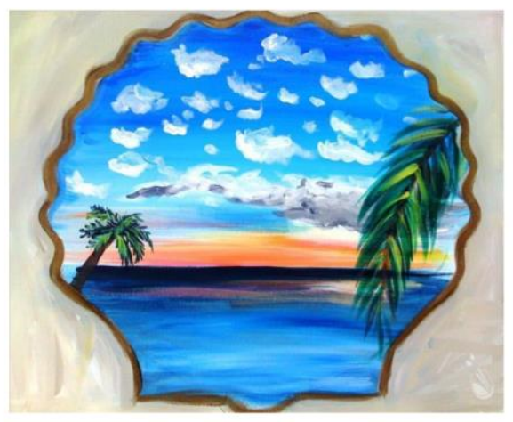
Thursday, April 24, 2025, 6:00 p.m. to 8:00 p.m.

To be held at Painting with a Twist, 2298 E. Ventura Blvd., CAMARILLO, Ca 93010