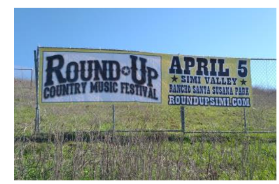
L-R: Friends of Kiwanis at Varenita Senior Living make neck coolers for veterans; members greeted guests and sold refreshments at the Simi Library for Read Across America; signs and banners have been placed all over town to announce our upcoming Round*Up Country Music Festival, including this one beside a freeway.