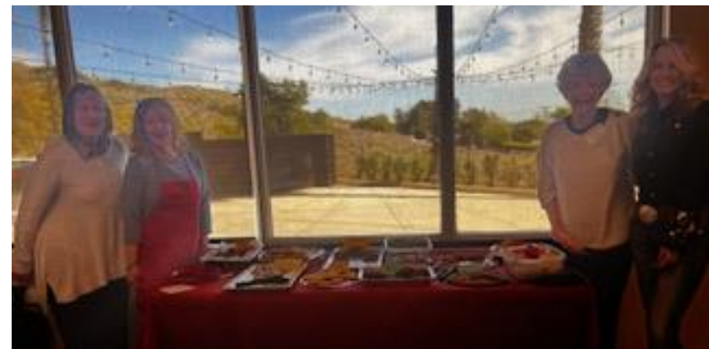
Ventura Kiwanis recently held its annual cookie contest with 11 entrants. The attendees chose the 3 favorites (2nd place was a joint effort.)