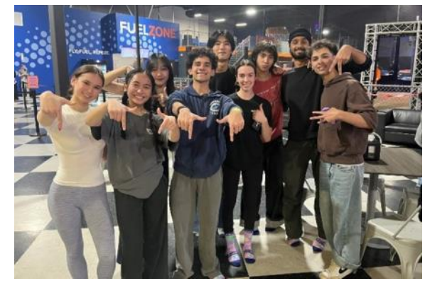
KIWIN'S working the Gift-Away for the homeless.