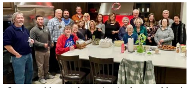
Our monthly social meeting is always a blast!