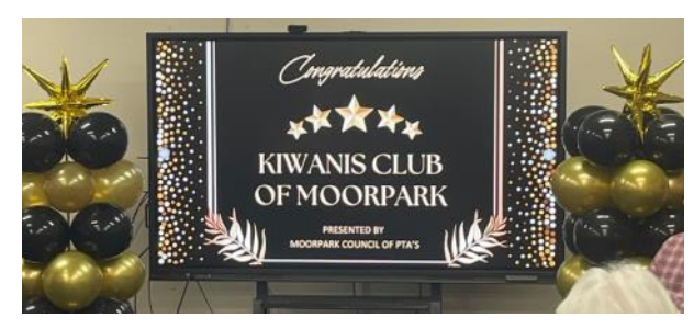
Our club was honored by the Moorpark PTA Council as their community partner!