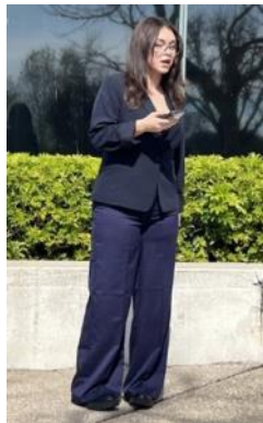
LTG Candidate Speech