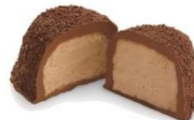
Bordeaux™ Egg A tasty classic. 3 oz $8.75 #509501