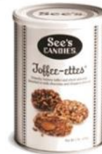
Toffee-ettes® Crunchy toffee, milk chocolate and almonds. 1 lb $31.00 #500316