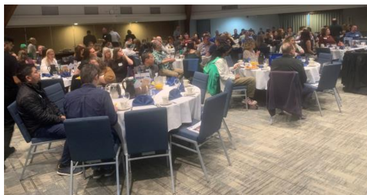
Ventura Kiwanis participates in the monthly Ventura Chamber Connection Breakfast. 114 in attendance this month!