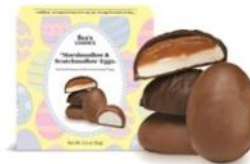
Marshmallow & Scotchmallow® Eggs One box, four yummy eggs. 3.4 oz $9.50 #503321