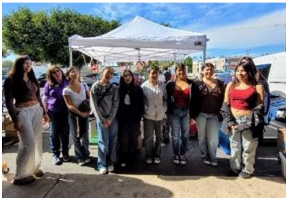
KIWIN'S working the Gift-Away for the homeless.

Although most of us were at home waiting for the Super Bowl to start, the Turquoise Div. KIWIN'S were working for Shelter Care Resources in Oxnard at their annual Gift-Away for the homeless event. The KIWIN'S February DCM was held at the Sky Zone Trampoline Park in Thousand Oaks, where they ended having a tough game of bouncing-basketball - boys vs. girls.