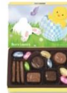
Bunny & Chick Box Beloved See's Classics. 4.8 oz $13.25 #507952