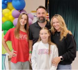
A TERRIFIC Family!