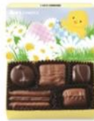
Happy Chick Assortment Full of See's favorites. 3.5 oz $11.50 #507951