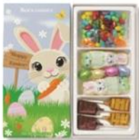
Hoppy Bunny Box An array of adorable bites. 8.6 oz $14.00 #510779