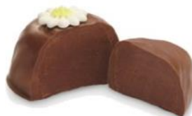
Chocolate Butter Egg Creamy and delicious. 3 oz $8.75 #509500