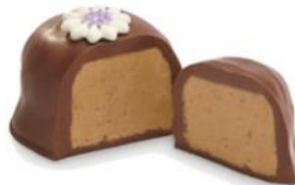
Peanut Butter Egg An irresistible treat. 3 oz $8.75 #509499