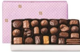
Assorted Chocolates Milk and dark decadence. Delivered in seasonal wrap. 1 lb $31.00 #540318