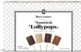
Assorted Lollipops Vanilla, Butterscotch, Café Latté and Chocolate. Naturally & artificially flavored. Approximately 30 lollipops. 1 lb 5 oz $31.00 #506545