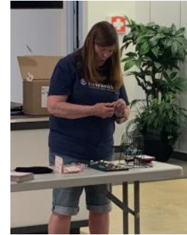
Postponed due to the fires and bad weather, we finally enjoyed our New Year's Bash on Feb. 19 with fun and games.