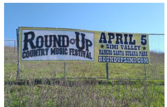
L-R: Friends of Kiwanis at Varenita Senior Living make neck coolers for veterans; members greeted guests and sold refreshments at the Simi Library for Read Across America; signs and banners have been placed all over town to announce our upcoming Round*Up Country Music Festival, including this one beside a freeway.