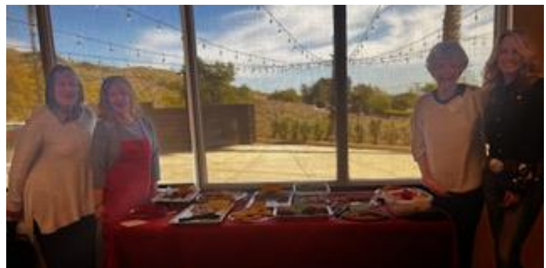
Ventura Kiwanis recently held its annual cookie contest with 11 entrants. The attendees chose the 3 favorites (2nd place was a joint effort.)