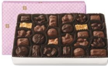
Nuts & Chews Yummy, crunchy and chewy. Delivered in seasonal wrap. 1 lb $31.00 #540334

Order for yourself or send a Spring Candy Gram to someone special in Simi Valley or Moorpark FREE DELIVERY!