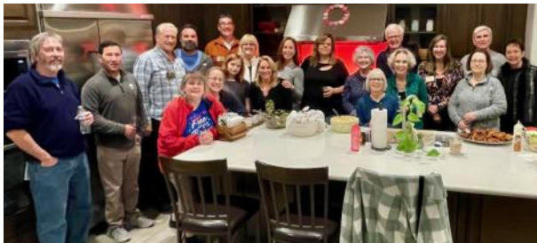
Our monthly social meeting is always a blast!

Each recipient receives a pencil, bumper sticker, book mark, and certificate. Parents are invited to each assembly, and every student gets individual recognition.