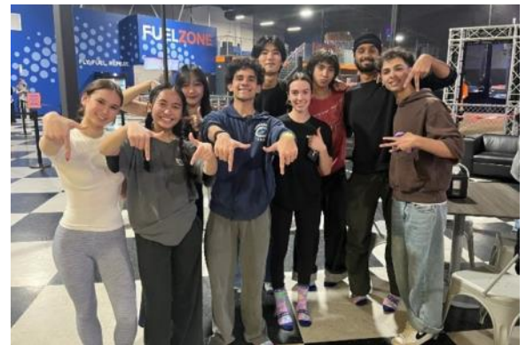
KIWIN'S DCM at the Sky Zone.