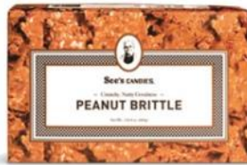
Peanut Brittle Buttery, crunchy and irresistible. 1 lb 8 oz $31.00 #500355