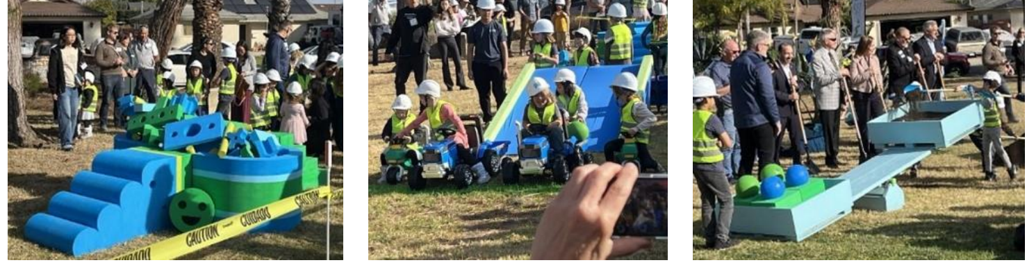
The kids had a lot of fun with this very entertaining groundbreaking ceremony.

At the end of January, kidSTREAM finally had their official groundbreaking ceremony for phase one of the children's museum construction. Although the city dignitaries were all there, the ceremony was cleverly done as a science project for kids where they had to change potential energy into kinetic energy. Starting with searching for 4 balls among a pile of material, using carts they moved the balls to a slide. At the bottom of the slide kids in tractor trailers had to move them to a seesaw lever which also contained weights. This is where the shovels came into play, as they had to fill up the other side of the lever with dirt until it moved, which started a timer. That set off confetti guns!