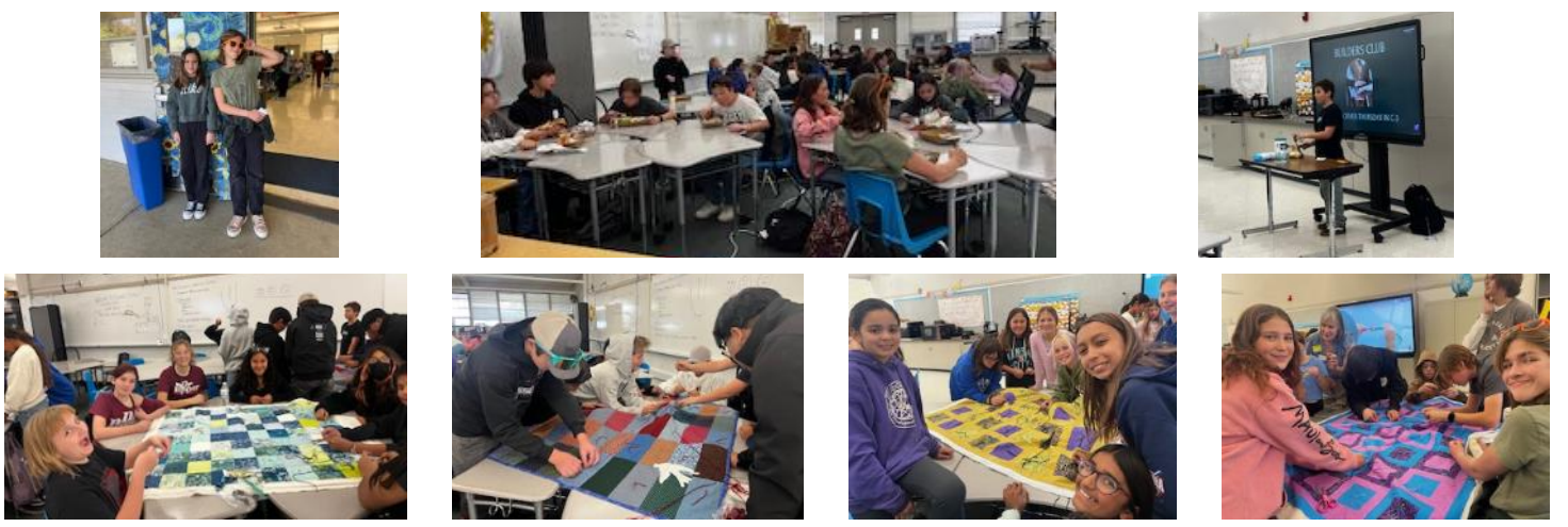
The Vice President and Secretary greet DATA Builders Club members for a quilt making session. The President called the meeting to order with a PowerPoint presentation, and the members worked on the quilts for cancer patients.

The Ventura Aktion Club helped the Ojai Valley Land Conversancy plant seeds in the Ojai Meadows Preserve. Members were also educated on the restoration of the area and how it affects our future.