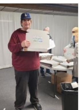
DIVISION 42 NEWSLETTER