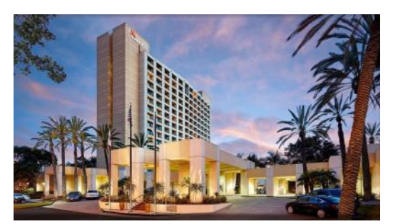
San Diego Marriott Mission Valley 8757 Rio San Diego Dr., San Diego, CA

Last day to book with our discounted rate of $189.00 per night (+ taxes & fees) is March 6, 2025, or until our contracted room block is sold out, whichever comes first. *Discounted overnight self-parking of $25 per car, per night.