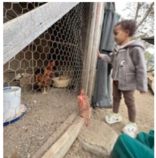
Kiwanis of Oxnard partners with Seaside Cowboys horsemanship program in Oxnard, sharing the healing aspects of horsemanship with the youth of the community. Here are a few moments.