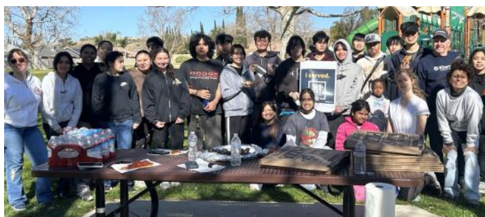
To honor the MLK Day of Service, members joined with our Key Clubs and Circle K volunteering for the park district. We helped paint the Colony House's steps and rails at Strathearn Historical Park, and a long block wall at Verde Park.