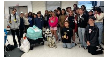
The DATA Builder's Club also collected towels for delivery to the Humane Society.