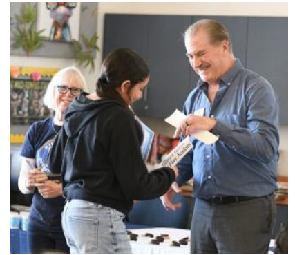
Moorpark has TERRIFIC Kids! And Moorpark has TERRIFIC volunteers!

Every year, Moorpark Kiwanis volunteers with traffic control and cheers on the runners at the Groundhog 5K race.