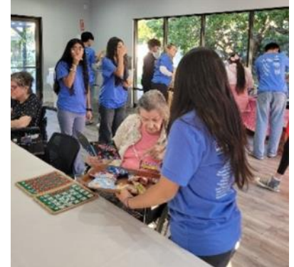
Builders Club entertaining the elderly at Aasta

At the end of January, kidSTREAM finally had their official groundbreaking ceremony for phase one of the children's museum construction. Although the city dignitaries were all there, the ceremony was cleverly done as a science project for kids where they had to change potential energy into kinetic energy. Starting with searching for 4 balls among a pile of material, using carts they moved the balls to a slide. At the bottom of the slide kids in tractor trailers had to move them to a seesaw lever which also contained weights. This is where the shovels came into play, as they had to fill up the other side of the lever with dirt until it moved, which started a timer. That set off confetti guns!