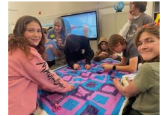
The Vice President and Secretary greet DATA Builders Club members for a quilt making session. The President called the meeting to order with a PowerPoint presentation, and the members worked on the quilts for cancer patients.