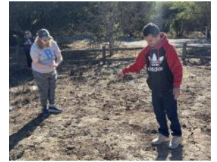
The Ventura Aktion Club helped the Ojai Valley Land Conservancy plant seeds in the Ojai Meadows Preserve. Members were also educated on the restoration of the area and how it affects our future.