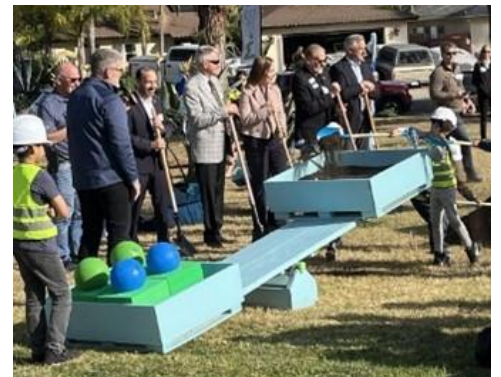
The kids had a lot of fun with this very entertaining groundbreaking ceremony.

In February, we were back at kidSTREAM again, where we joined many other volunteers putting together 500 gift boxes for kids across Southern California that were affected by the fires. The best part was how we quickly set up teams and eliminated any bottlenecks to have two smoothly running production lines. We were done in one hour, including consuming lots of pizza. Working together with other volunteering groups is certainly getting the Kiwanis name out into our community.