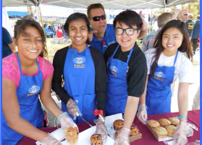
Moorpark Kiwanians and Key Club members serve our veteran's and guest coffee and snacks at the Memorial Day observance.