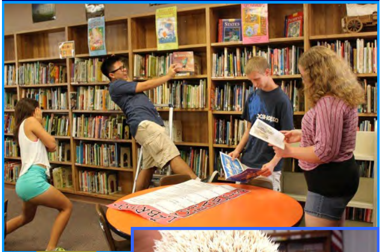
(Below) Key clubbers not only work hard, but have a fun while doing it!