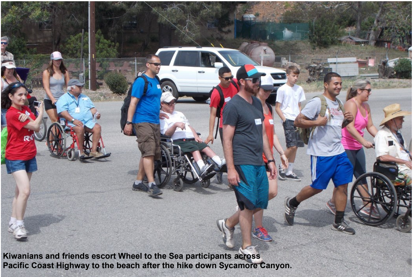
Kiwanians and friends escort Wheel to the Sea participants across Pacific Coast Highway to the beach after the hike down Sycamore Canyon.