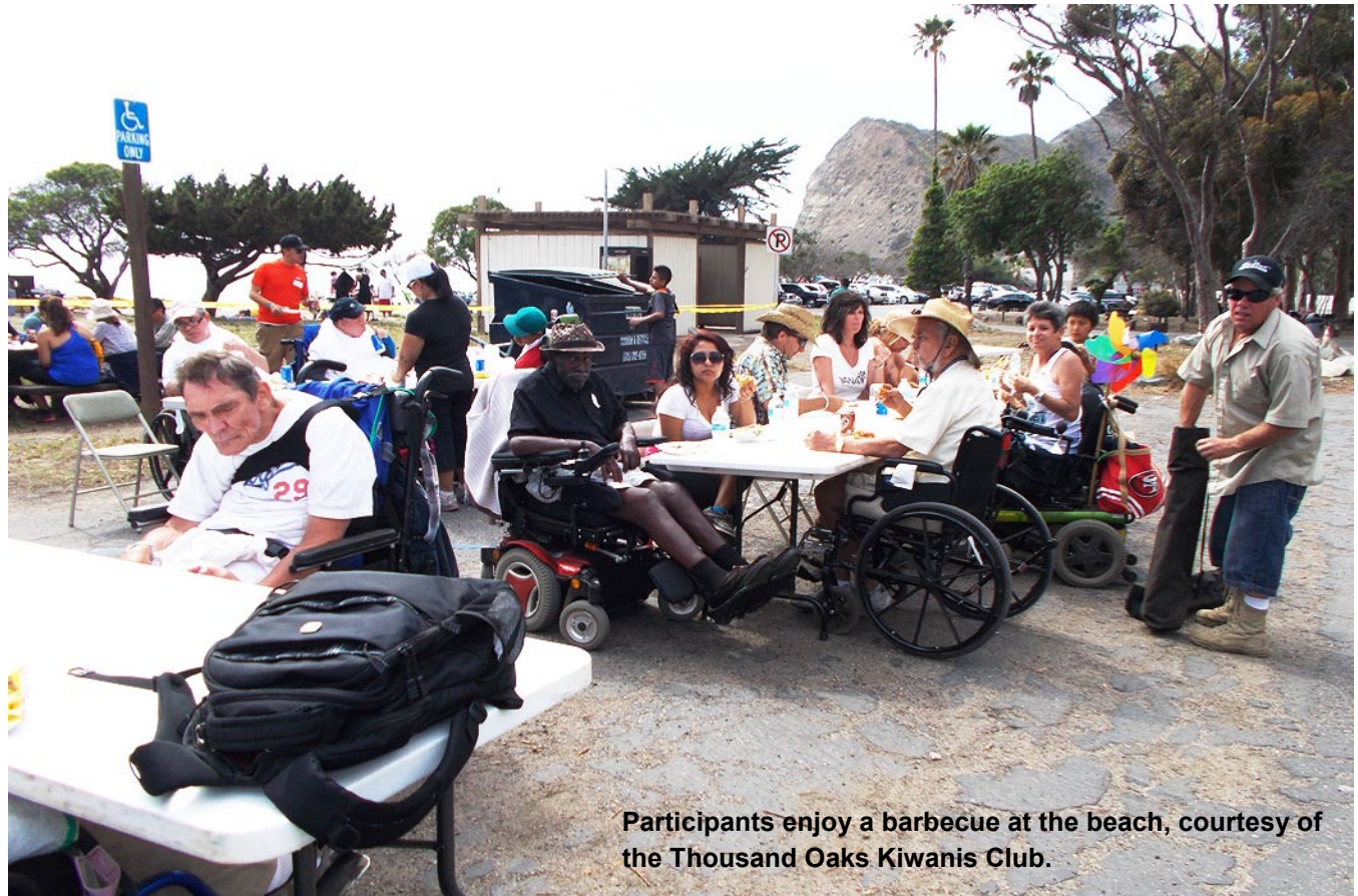
Participants enjoy a barbecue at the beach, courtesy of the Thousand Oaks Kiwanis Club.