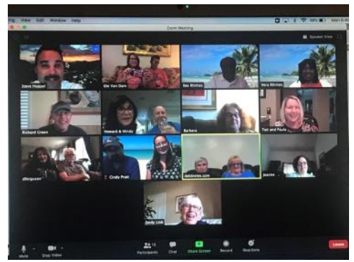
<u>Before</u> the lock-down, our members had a great time at our last social meeting! <u>After</u> the lock-down, we still had a great time at our monthly social meeting. The COVID virus could not stop our members from connecting and having fun via ZOOM.