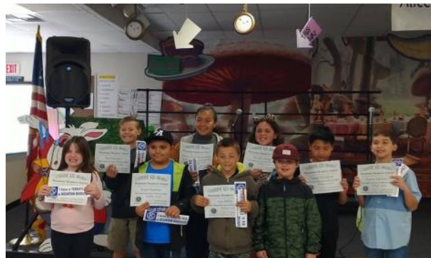
Before schools closed, our club held a TERRIFIC Kids ceremony at Mountain Meadows Elementary school.