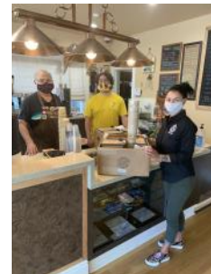
Oxnard Kiwanis donated coffee and pastries to 60 staff at Covid-19 testing center Clinicas de Camino Real in Oxnard.