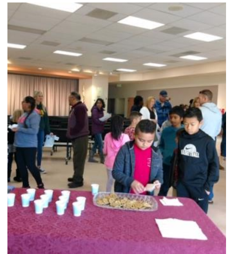
Peach Hill elementary has TERRIFIC KIDS who are Influential and Friendly!