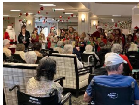
A wonderful morning at The Foothills Senior Living home. Some of our Builders and K-Kids clubs joined us Kiwanians to sing Christmas carols to the Seniors! The highlight of the morning was when a young lady of 100 years old spotted Santa and her face just lit up...of course we sang her a special Christmas song!