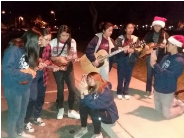
KIWIN'S practicing before setting out

The KIWIN'S from Camarillo High and Rancho Campana spent an evening Caroling for Cans where they entertained local residents in exchange for food donations which went to a local church food share.