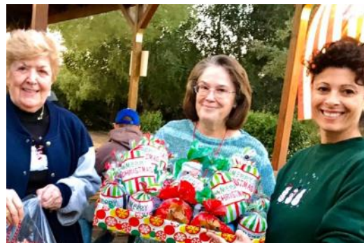
An evening of happy, well fed people at the Samaritan Center...on a very cold night! Everyone was in the Christmas spirit and brought multiple goodies! Our Kiwanis members made an awesome chicken soup full of meat and veggies, cornbread, rice, salad and other tasty dishes! During the meal we passed out goodie bags with socks, toiletries, and other small items.