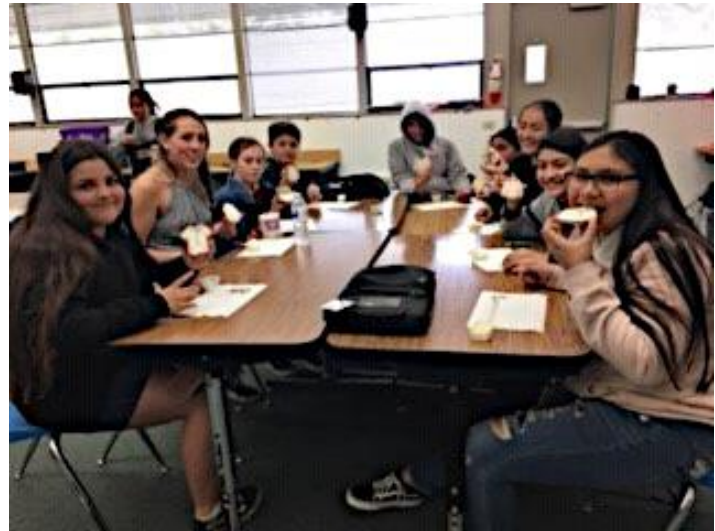
Ventura Kiwanis' DATA Builders Club celebrated obtaining their UNICEF ELIMINATE goal of raising $250 by having an Ugly Sweater cookie decorating contest.