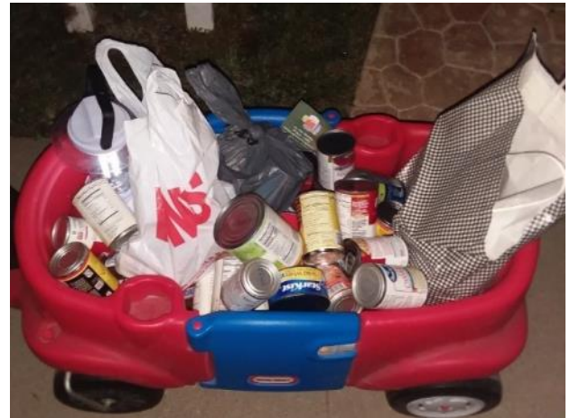
Some of the loot to be taken to a local pantry