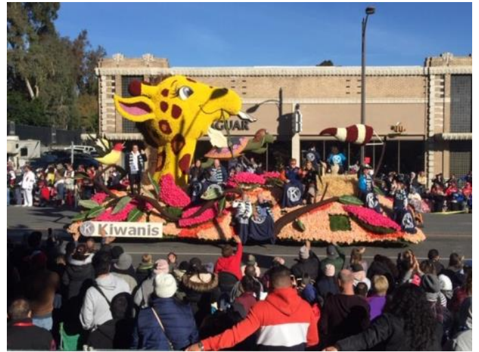
Some of us were lucky to view the Kiwanis float live at the Rose Parade!