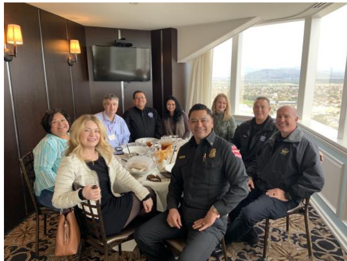
1st meeting of the year ... off to a great start with a potential new member!