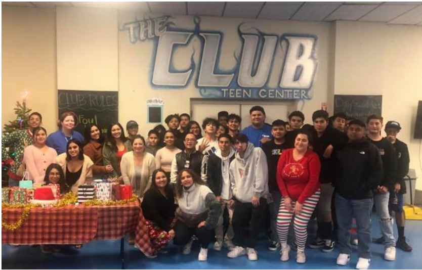
Local teens say thank-you!