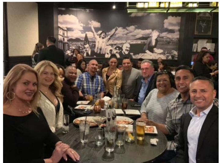
Kiwanis teamed up with the Boys and Girls club for a Toys for Teens gift card drive at Setebello in Oxnard.