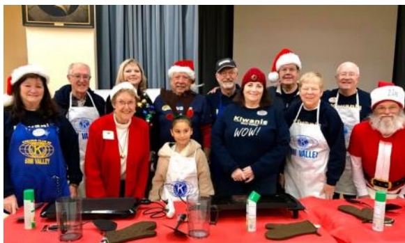
A great morning with our Kiwanis and School Staff friends! We got up before the crack of dawn to set up, start making pancakes, and serve a holiday breakfast to 300 children and their families at Berylwood Elementary!