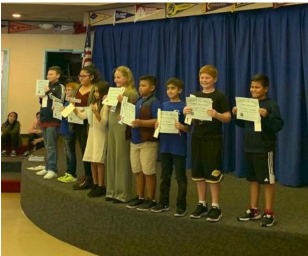
Moorpark has TERRIFIC KIDS at Campus Canyon and Walnut Canyon Schools! This month, students who exemplified Respectful and Responsible traits were recognized!