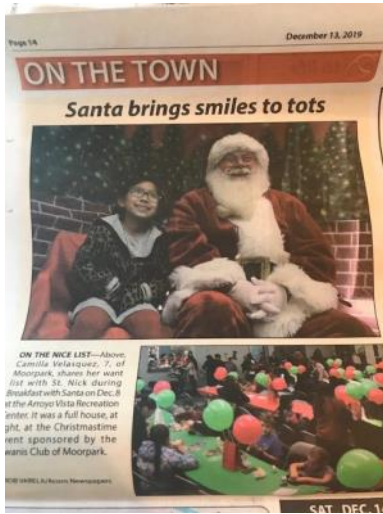
Our annual Breakfast with Santa event reported last month was covered in our local Acorn newspaper.