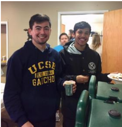
We can always count on UCSB-CKI members to come help at events.