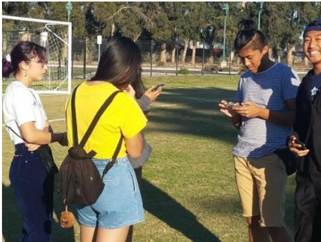
The four cheer leaders fine-tuning the cheer

October was a quiet month for most of our members, but the Turquoise Div. KIWIN'S were very busy practicing their cheers for Fall Rally at Knotts Berry Farm on Saturday, November 23. They will be competing against all the other KIWIN'S Divisions for the Spirit Award. Once a week they could be found in a Camarillo or Oxnard Park working on their cheers for two hours. In today's world all they need is their cell phones to make sure everyone is in unison for the cheers.