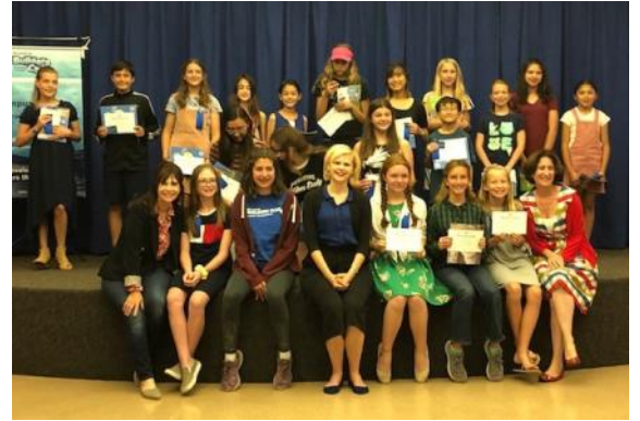
Campus Canyon Builders Club 2019-2020 Officer Installation