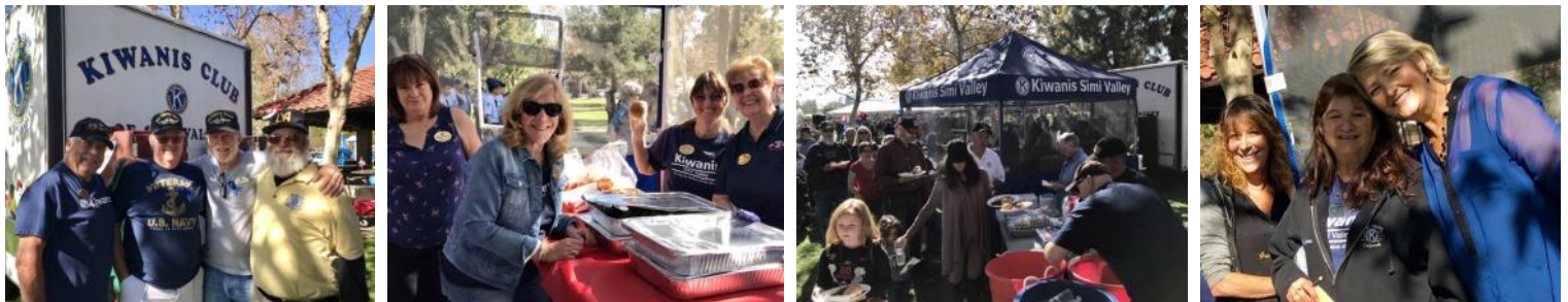
Following the Veterans Day Ceremony we served lunches to our veterans, their families, and volunteers!