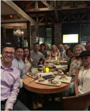
October Social at Larsen's Grill—members, potential members, volunteers