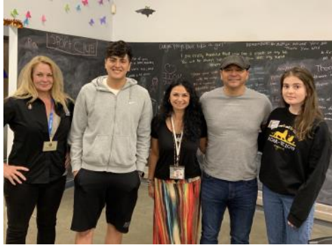
October DCM with Key Club LTGs