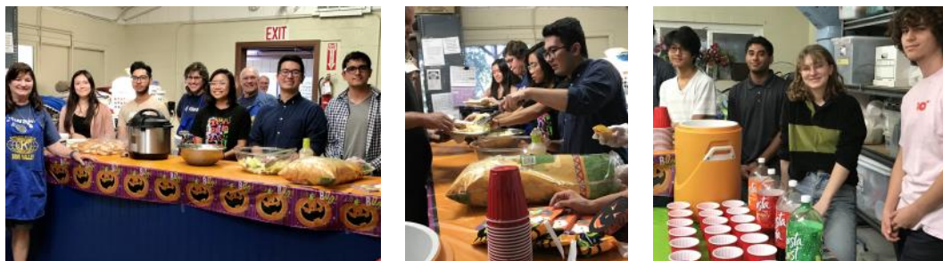
Our Circle K Club from Moorpark College joined us serving dinner to the homeless at the Samaritan Center.