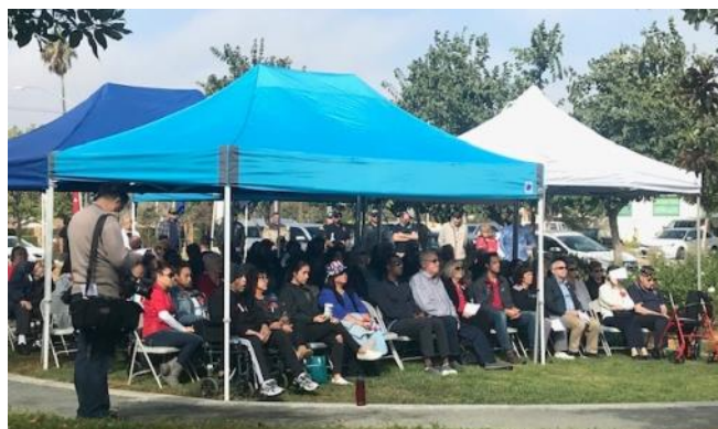
Our club provides coffee and snacks to Veterans and guests at the annual Moorpark Veteran's Day ceremony.