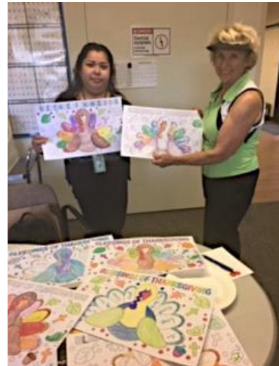
Our DATA Builders Club members made placemats for Ventura Senior Center's Thanksgiving dinner.