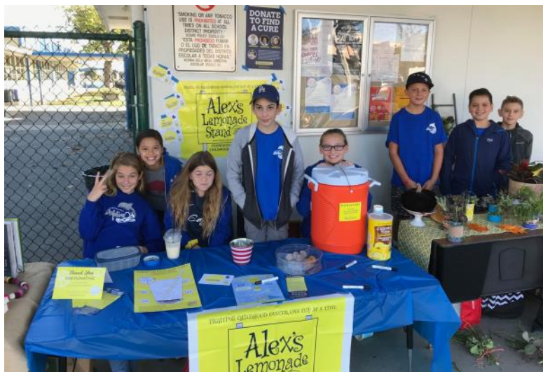
Juanamaria Elementary K-Kids held a fundraiser for childhood cancer research. They blew away their goal of $100 by raising $269!