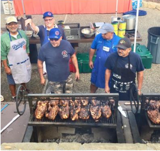
Kiwanis served 250 supporters at a barbeque event called Summit for Danny to raise money for drug support for youth.