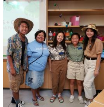
KIWANIS' Training Conference—Rancho Campana, Adolfo Camarillo, St. Bonaventure, Foothill, and Hueneme High Schools