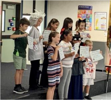
Moorpark Kiwanis Club presents TERRIFIC kids awards every Friday at all our elementary schools.