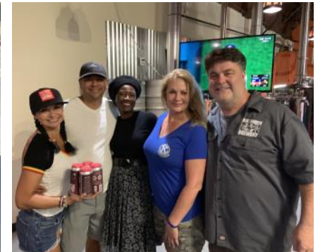
OXtoberfest - we served Bratwurst and Pretzels at Red Tandem Brewery in Oxnard