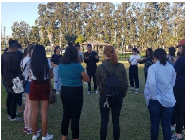
Saturday practice in Oxnard