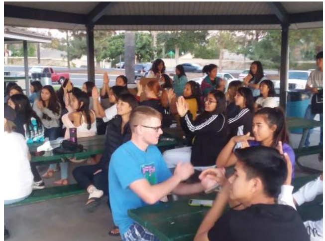
Friday night practice in Camarillo