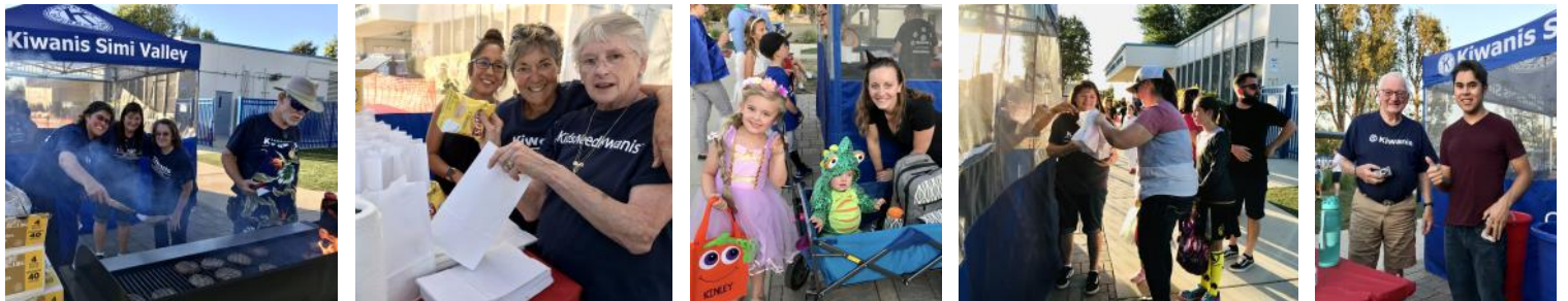
At Township Elementary, helping out at their PTA fundraiser night: Trunk or Treat/Harvest Festival! Fun for all!