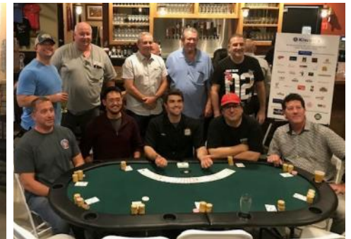
Our 2019 Poker Tournament was a great success! Every player left with a prize! At right: the final 10!