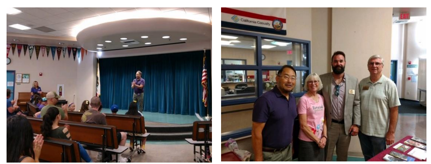
Moorpark Kiwanis Club continues the tradition of honoring TERRIFIC KIDS at all of our local elementary schools.