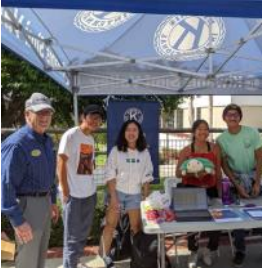
Our Circle K Club at Moorpark College does club rush.