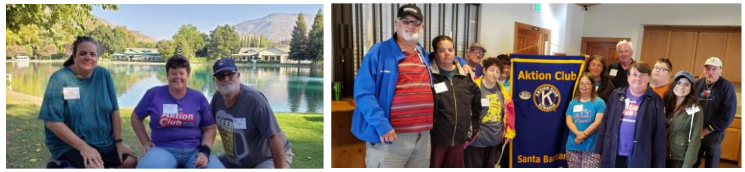
The Aktion Club of Santa Barbara attended the annual Cal-Nev-Ha Aktion Club convention in Wonder Valley. Members learned about other clubs and took on leadership roles at the conference.