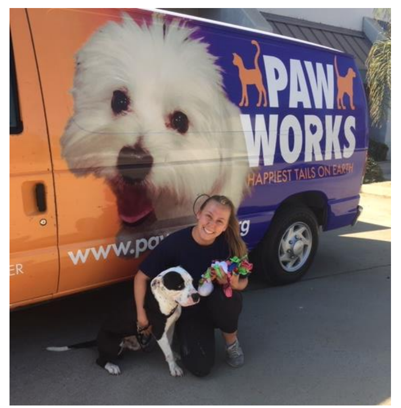
Key Club Division 42 West made play toys for rescue animals. The toys were donated to the non-profit Paw Works through the Oxnard Kiwanis club.