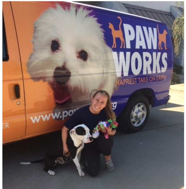
Key Club Division 42 West made play toys for rescue animals. The toys were donated to the non-profit Paw Works through the Oxnard Kiwanis club.