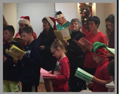
On December 15, we went caroling with some of our SLP's at The Foothills senior community.