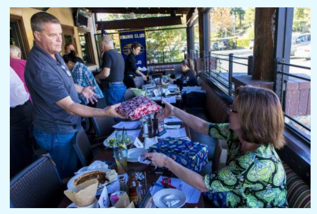
Our Foundation purchased gifts for a BumbleBee family - a mom, dad, and 5 kids. The BumbleBee Foundation helps pediatric cancer families. We wrapped the gifts at our December 12 noon meeting.