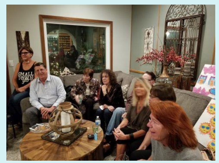
One of our Friday evening parties at a member's home.