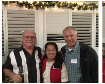
Smiling faces despite being ready to evacuate.