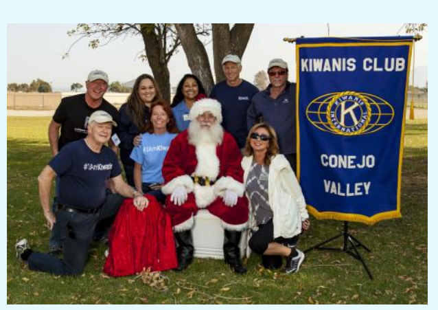
On the afternoon of Dec. 16, Conejo Valley Kiwanis provided sandwiches, and Thousand Oaks brought drinks for the Key Club Doggie DCM at Freedom Park in Camarillo. Key Club members brought canned food donations for Manna - Conejo Valley.

The December 2017 edition of 805 Living featured Conejo Valley Kiwanis in its "Good Deeds" section. Our appreciation goes to 805 Living for recognizing the work that we do for the children and youth of our community.