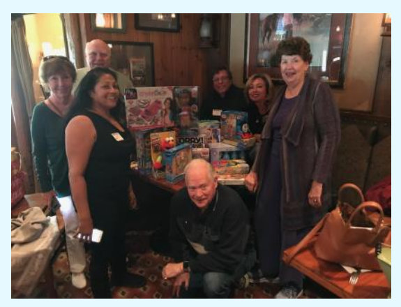
On December 5 each member brought gifts for the Thousand Oaks Police to give to 150 Safe Passage children, age 5-10. Safe passage is a partnership of T.O.P.D. and Conejo Recreation & Park District to abolish gang-related crime.