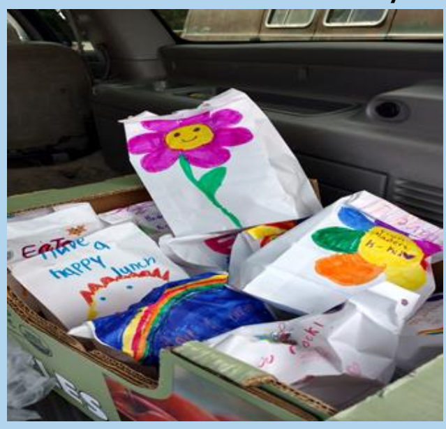
In addition, our K-Kids collected over 120 canned goods for a food pantry before Thanksgiving.

K-Kids decorated over 40 bags with cheerful colors and sayings, then packed each one with a nutritious and tasty lunch to be served at the Samaritan Center the next day.