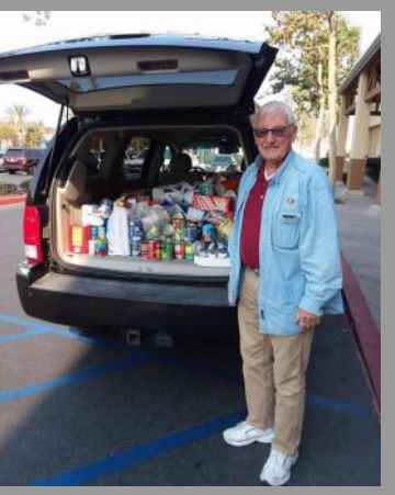
At our Round*Up Against Hunger food drive on Dec. 16, together with our SLP's we collected donations for six hours in front of 8 local markets to help feed the needy in our community.