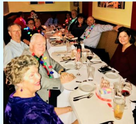
We held our Holiday Party and gift exchange at Spumoni on December 15 to thank them for their support of Conejo Uncorked.