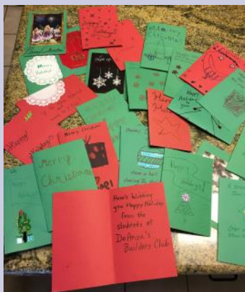
Cards made by Data Builders Club kids for delivery with Meals on Wheels