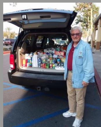
At our Round*Up Against Hunger food drive on Dec. 16, together with our SLP's we collected donations for six hours in front of 8 local markets to help feed the needy in our community.