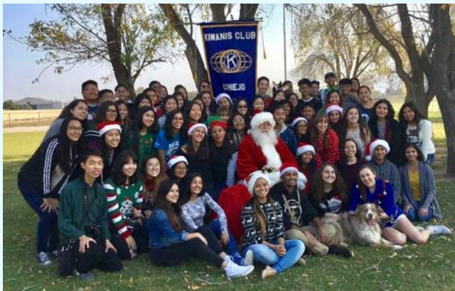
On the afternoon of Dec. 16, Conejo Valley Kiwanis provided sandwiches, and Thousand Oaks brought drinks for the Key Club Doggie DCM at Freedom Park in Camarillo. Key Club members brought canned food donations for Manna - Conejo Valley.