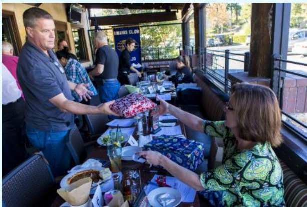
Our Foundation purchased gifts for a BumbleBee family - a mom, dad, and 5 kids. The BumbleBee Foundation helps pediatric cancer families. We wrapped the gifts at our December 12 noon meeting.