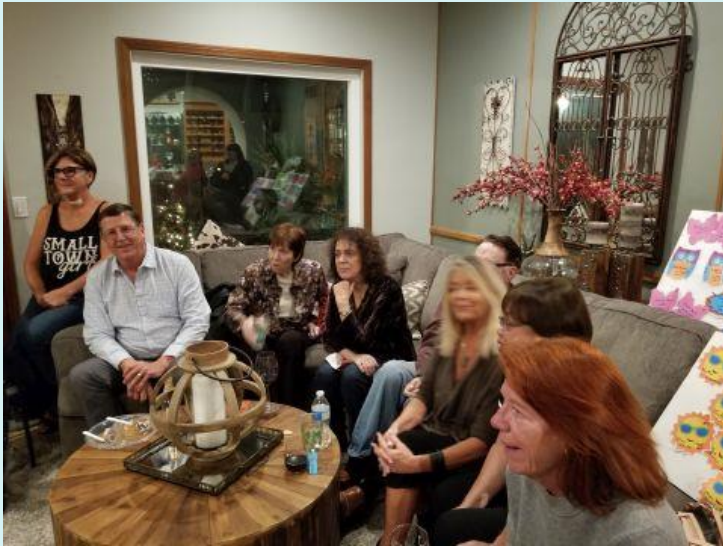
One of our Friday evening parties at a member's home.