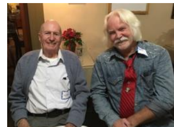
Our 2018 Resolution... Be Prepared.