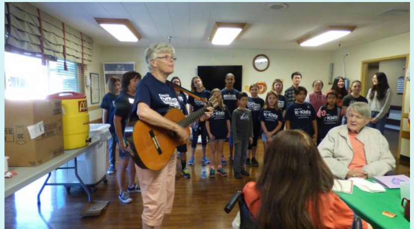
Providing Thanksgiving breakfast and singing at a retirement home. Key Club, Builders Club and K-Kids members provided the entertainment.