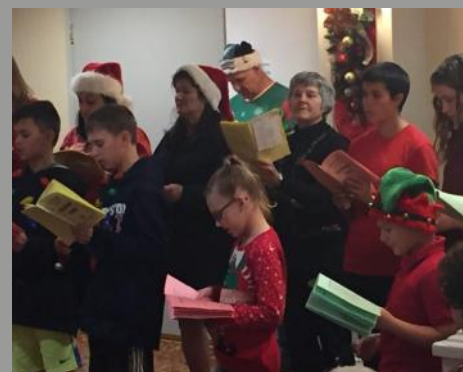
On December 15, we went caroling with some of our SLP's at The Foothills senior community.