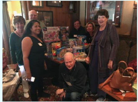
On December 5 each member brought gifts for the Thousand Oaks Police to give to 150 Safe Passage children, age 5-10. Safe passage is a partnership of T.O.P.D. and Conejo Recreation & Park District to abolish gang-related crime.