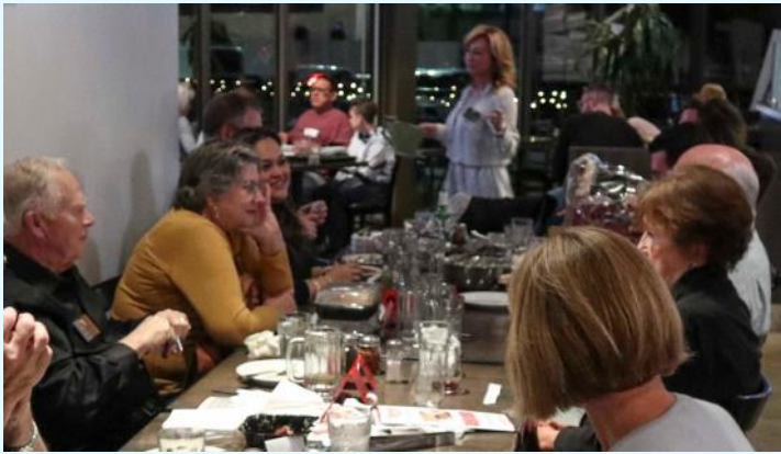
On November 17 we had our first social of the year at Barone's to thank them for their support of Conejo Uncorked.