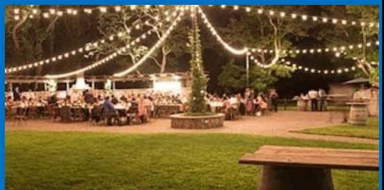
Our annual Wine & Moonlight fundraiser was awesome! Wine and beer tastings, appetizers, live music, silent auction, and raffle were enjoyed by our sold out crowd!