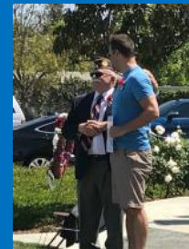
The Kiwanis Club of Moorpark proudly serves veterans and guests at the Moorpark Memorial Day commemoration.