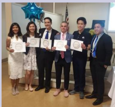
Immediate Past Presidents receiving awards for their outstanding leadership.

On May 27, Turquoise Div. KIWIN'S held their awards banquet with the theme of "The Enchanted Tale of Service." We had great entertainment, were well fed, and the awards ceremony was fun. Most improved club of the year was Hueneme High, and the Club of the Year award went to Saint Bonaventure High.