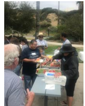
Burgers, dogs, chips, and watermelon await 200 autistic kids and volunteers.