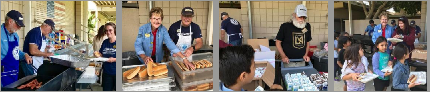
On June 6, we cooked about 500 hot dogs and helped serve lunch for Berylwood Elementary School's end of the year BBQ.