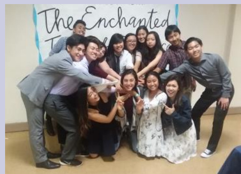
Camarillo High School KIWIN'S, as usual not camera shy.