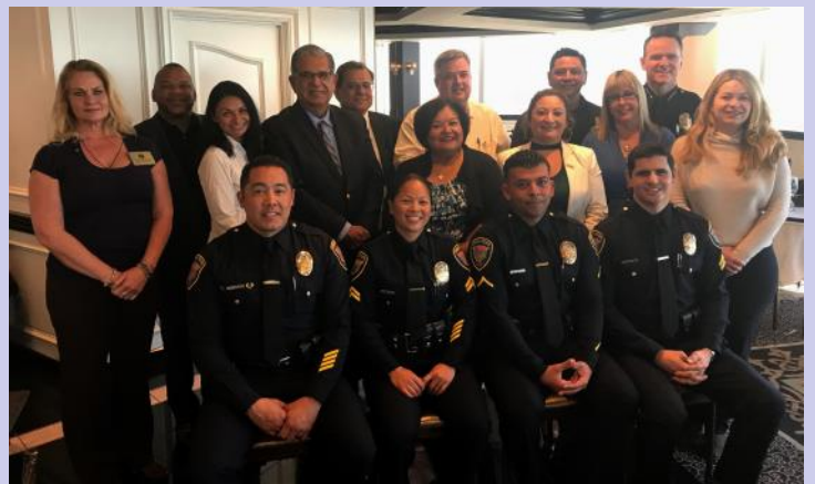
Police Officer of the Year nominees pose with Oxnard Kiwanians. Awards will be presented in April.