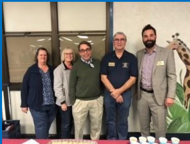
Our TERRIFIC KIDS program has terrific volunteers! Go Moorpark Kiwanis Club!