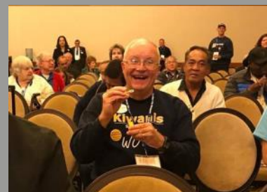
A dozen club members attended the District Midyear Conference in Pomona on Feb. 24.