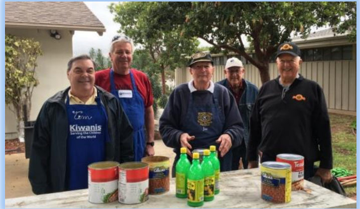
Kiwanis makes good friends!

Our first BBQ of 2018 was for about 150 at St. Andrews Pre-School. The rain threatened so we served inside and watched the kids play in a world of bubbles!