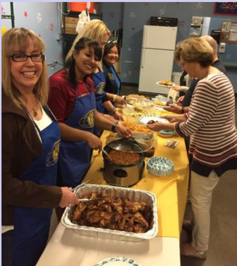
Oxnard was the host club for the March Division Council Meeting (DCM)!