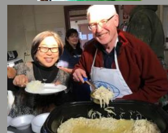
Our homeless-feeding crew celebrates St. Patty's at the Samaritan Center.