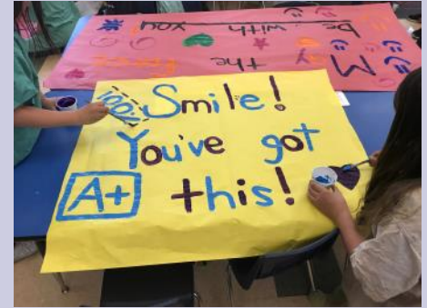
Juanamaria Elementary School K-Kids made posters for testing week.