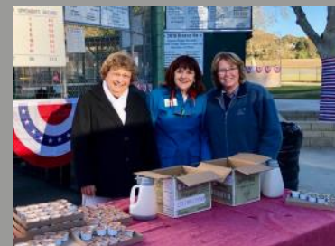
That same day, another group of our members joined the YMCA Y's Men to cook and serve a pancake breakfast for Simi Valley Youth Baseball's Opening Day!