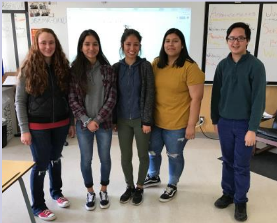
Buena High School Key Club officers for 2018/2019