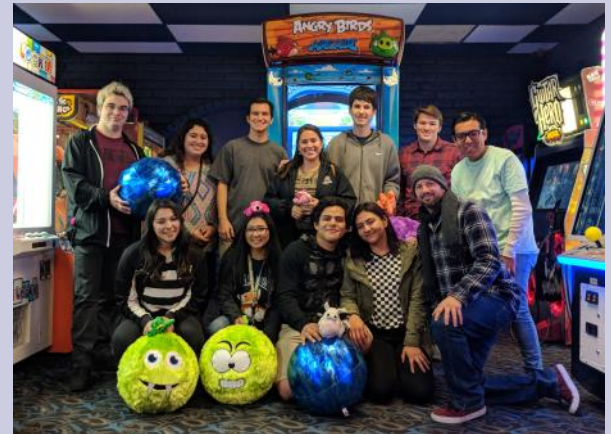
Ventura College Circle K Club bonding day at Golf 'n' Stuff