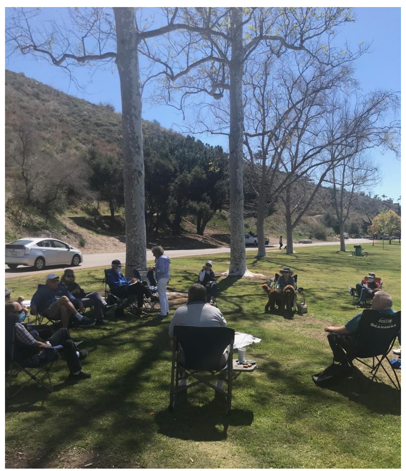
We will resume in-person meetings at Poinsettia Pavilion on Friday May 7th at noon. We continue to volunteer at Salvation Army food pantry on Tuesdays. We will be granting scholarships to seniors from Ventura Unified School District soon. The picture above is of our semi-monthly meeting at Arroyo Verde Park in Ventura.