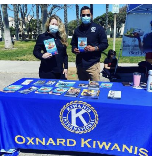
Oxnard participated in an anniversary fundraiser in Port Hueneme by Wheelhouse Dispensary and received $1000 donation