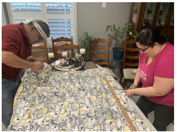
Our April general meeting featured a no sew blanket-making social.