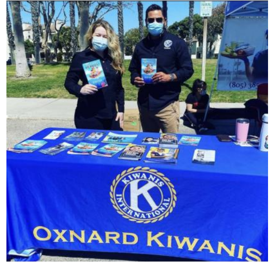
Oxnard participated in an anniversary fundraiser in Port Hueneme by Wheelhouse Dispensary and received $1000 donation