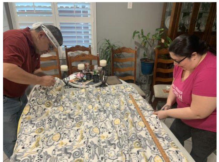
Our April general meeting featured a no sew blanket-making social.