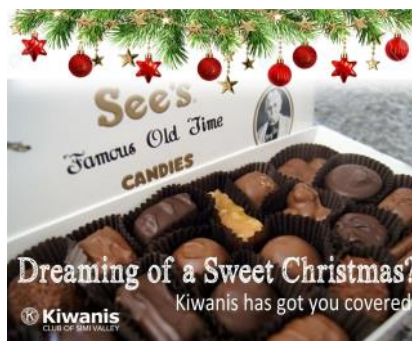
We did very well with the See's Fundraiser by opening it up to the community and providing free delivery. We sold more than $4600, and our profit was more than double what we usually do with this fundraiser.