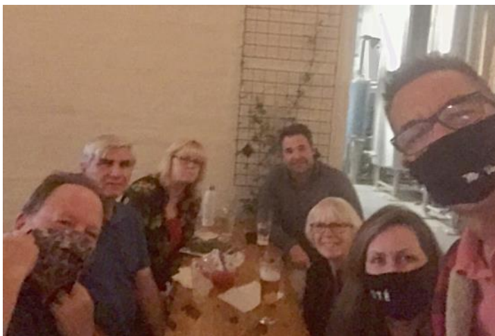
Our outdoor, masked, socially-distanced "social" at The Alley in Moorpark.