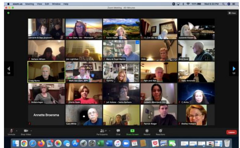
We have attended a lot of inter-clubs!