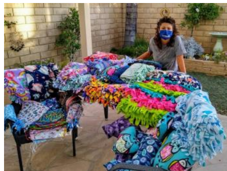
Our members are still doing tie blankets, pillows, happy bags, buddy dolls, and hospital gowns for Operation Smile, City of Hope, and foster homes.