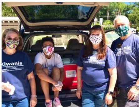
Simi Kiwanis is still volunteering to help with the delivery of overflow Meals on Wheels due to the corona-virus.