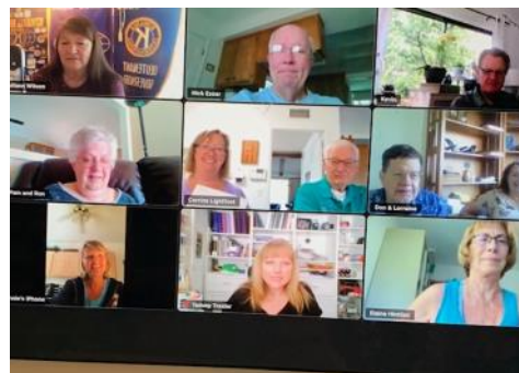
We continue to meet virtually on Zoom, but as of December all our meetings have moved to Wednesday evenings at 6:30pm. We meet every week except the second Wednesday of the month.