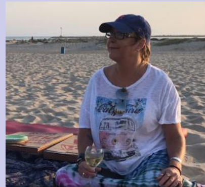
Here are a few photos of our Sunset Social Mixer at the beach.