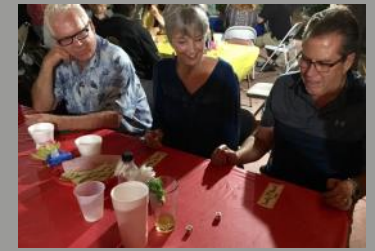
At the end of July, we held an LCR Fundraiser at Simi Hills Golf Course. Those crazy dice added to the fun.