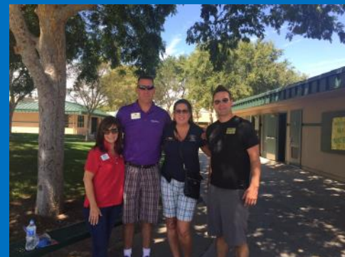
Moorpark Kiwanians volunteering at the Moorpark Education Foundation "Food Truck Meet-Up" event on Sept. 10. Great food and great fun for a great cause!