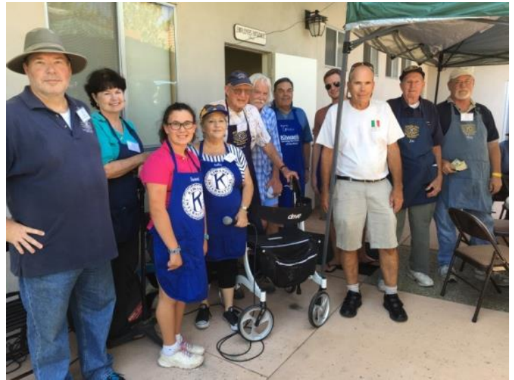
The BBQ Crew after a job well done

In August we had a successful BBQ fundraiser at Encina Royale to raise those needed funds that allow us to continue to serve worthy non-profits.