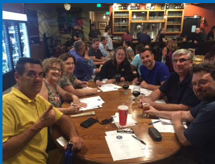
Moorpark Kiwanians are busy planning our upcoming Charity Poker Night which is on October 14 at McGregor's Craft Beer & Wine. For more information go to www. MoorparkKiwanisPoker.com