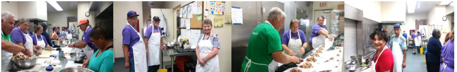
A group of 17 Aktion Club members attended the annual cooking class at the Westside Center, learning to create 7 different dishes including appetizers, salads and desserts.