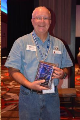
Our newsletter won Honorable Mention.