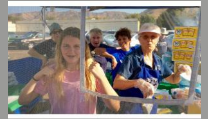
Summer is BBQ season, and we answered the call for two events. Above, we serve dinner for AYSO Opening Night on Aug. 25. Below, we're on hand for Wood Ranch PTA's Back to School BBQ / Movie Night on Sept. 15.