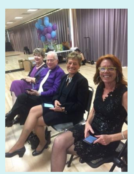
Clubs unite to honor KEY club Division 42 East at their end of year celebration. Thousand Oaks, Conejo, and Simi Valley saw D42E thank all their members for their extraordinary year. Oak Park KEY club received club of the year having amassed more than 1000 hours of service and thousands of dollars raised to change the world one child and one community at a time.