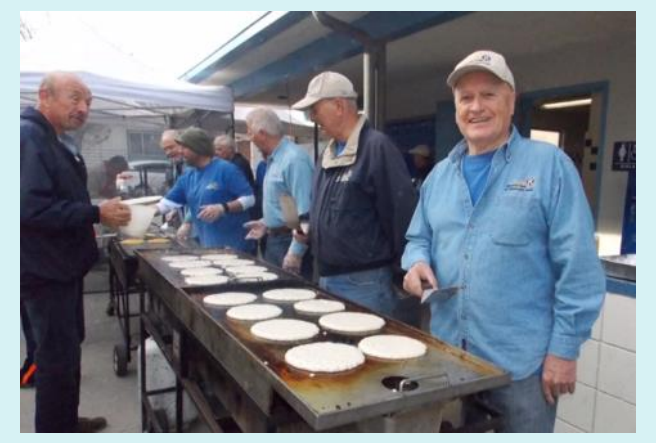
It's opening day and the TO club serves up some tasty ones to Little Leaguers as they start their season.