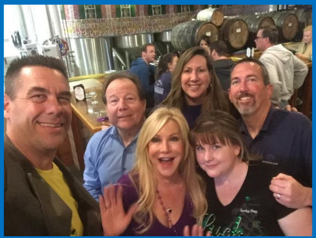
Members celebrating Fat Tuesday at Enegren's Brewery in Moorpark.