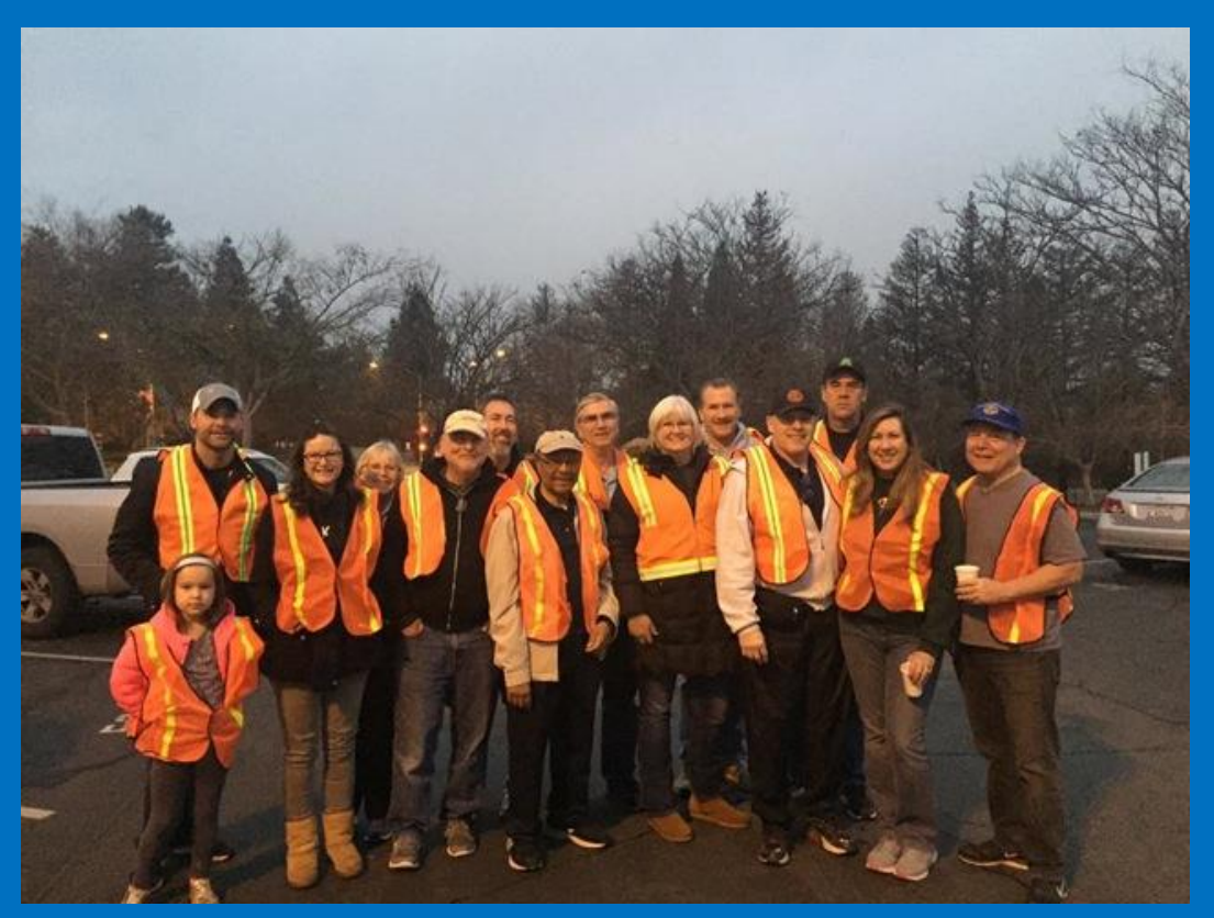
Moorpark Kiwanis Club volunteering at the 5th Annual Groundhog Run which benefits the Moorpark High School Cross Country and Track Teams.