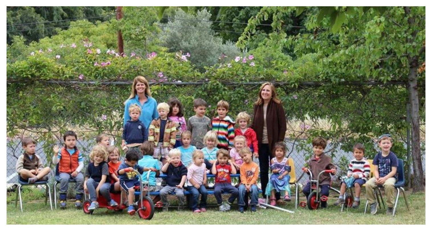
The rain stayed away for our 2017 BBQ Day for St. Andrew's Preschool. Over 200 Big and Little Happy People were fed chicken, hamburgers & hot dogs at the fundraiser on March 4th.