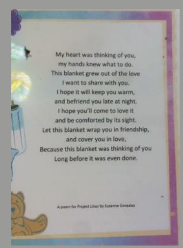
The Township Elementary K-Kids display one of eight blankets they made and donated to Project Linus. Every blanket a needy child receives has a label and poem attached.