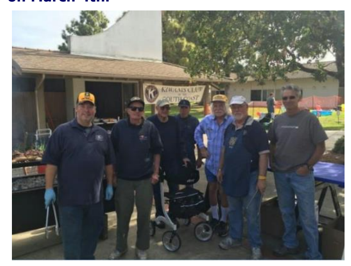
The BBQ team comes through again, supported by a strong crew!