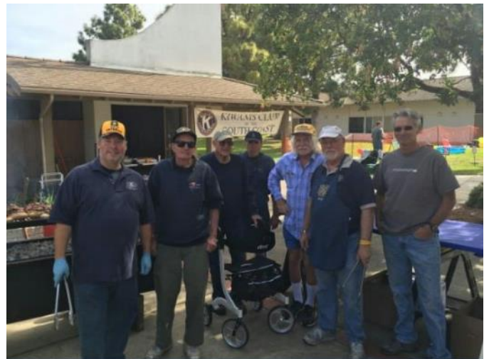
The BBQ team comes through again, supported by a strong crew!