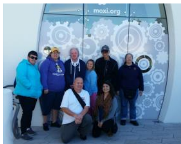
Aktion Club members were invited to give their opinions and suggestions regarding the not yet open MOXI The Wolf Museum.