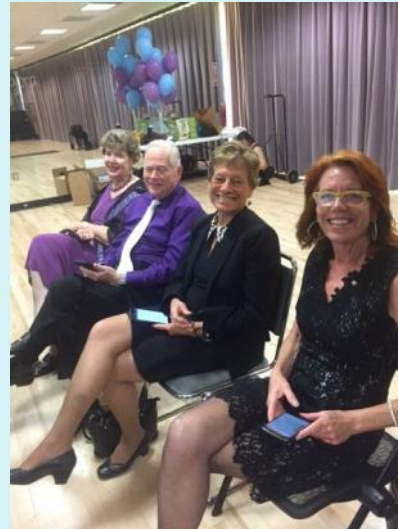
Clubs unite to honor KEY club Division 42 East at their end of year celebration. Thousand Oaks, Conejo, and Simi Valley saw D42E thank all their members for their extraordinary year. Oak Park KEY club received club of the year having amassed more than 1000 hours of service and thousands of dollars raised to change the world one child and one community at a time.