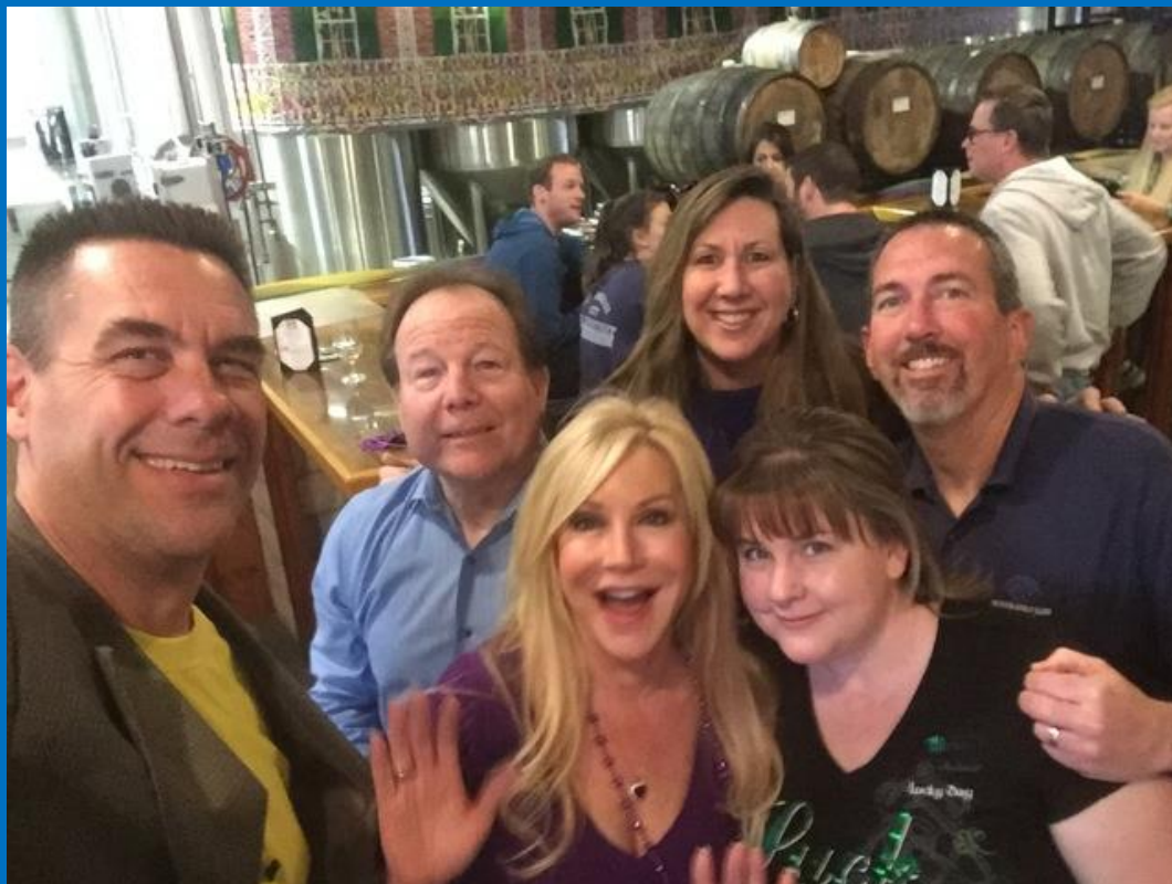
Members celebrating Fat Tuesday at Enegren's Brewery in Moorpark.