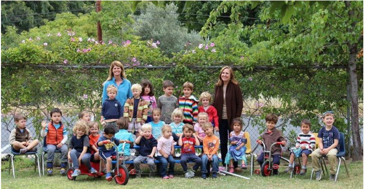
The rain stayed away for our 2017 BBQ Day for St. Andrew's Preschool. Over 200 Big and Little Happy People were fed chicken, hamburgers & hot dogs at the fundraiser on March 4th.