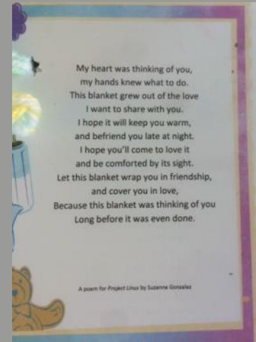
The Township Elementary K-Kids display one of eight blankets they made and donated to Project Linus. Every blanket a needy child receives has a label and poem attached.