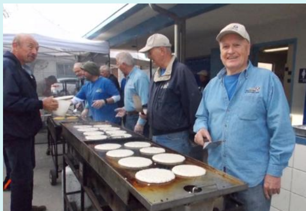
It's opening day and the TO club serves up some tasty ones to Little Leaguers as they start their season.