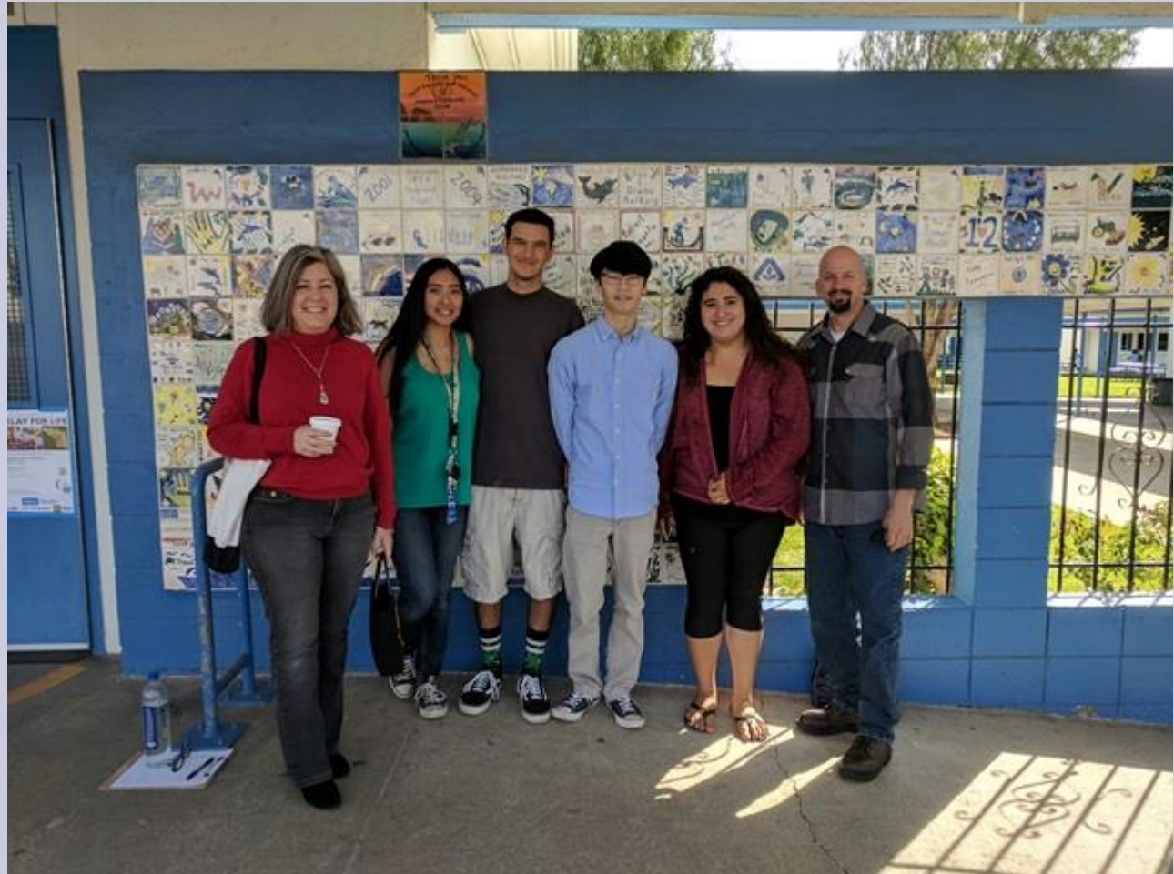
Circle K of Ventura College reads to the kids at Juanamaria Elementary School in Ventura. They spent the afternoon engaging with the students and reading their favorite books to them.