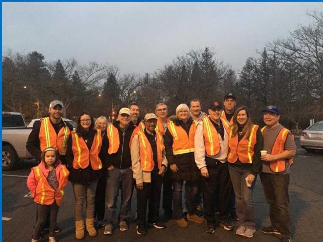
Moorpark Kiwanis Club volunteering at the 5th Annual Groundhog Run which benefits the Moorpark High School Cross Country and Track Teams.