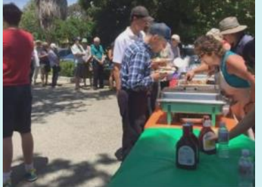
Kiwanis Club of Thousand Oaks serving lunch for Cancer Support Picnic at Wellness Center - the first event of 2 days in a row!