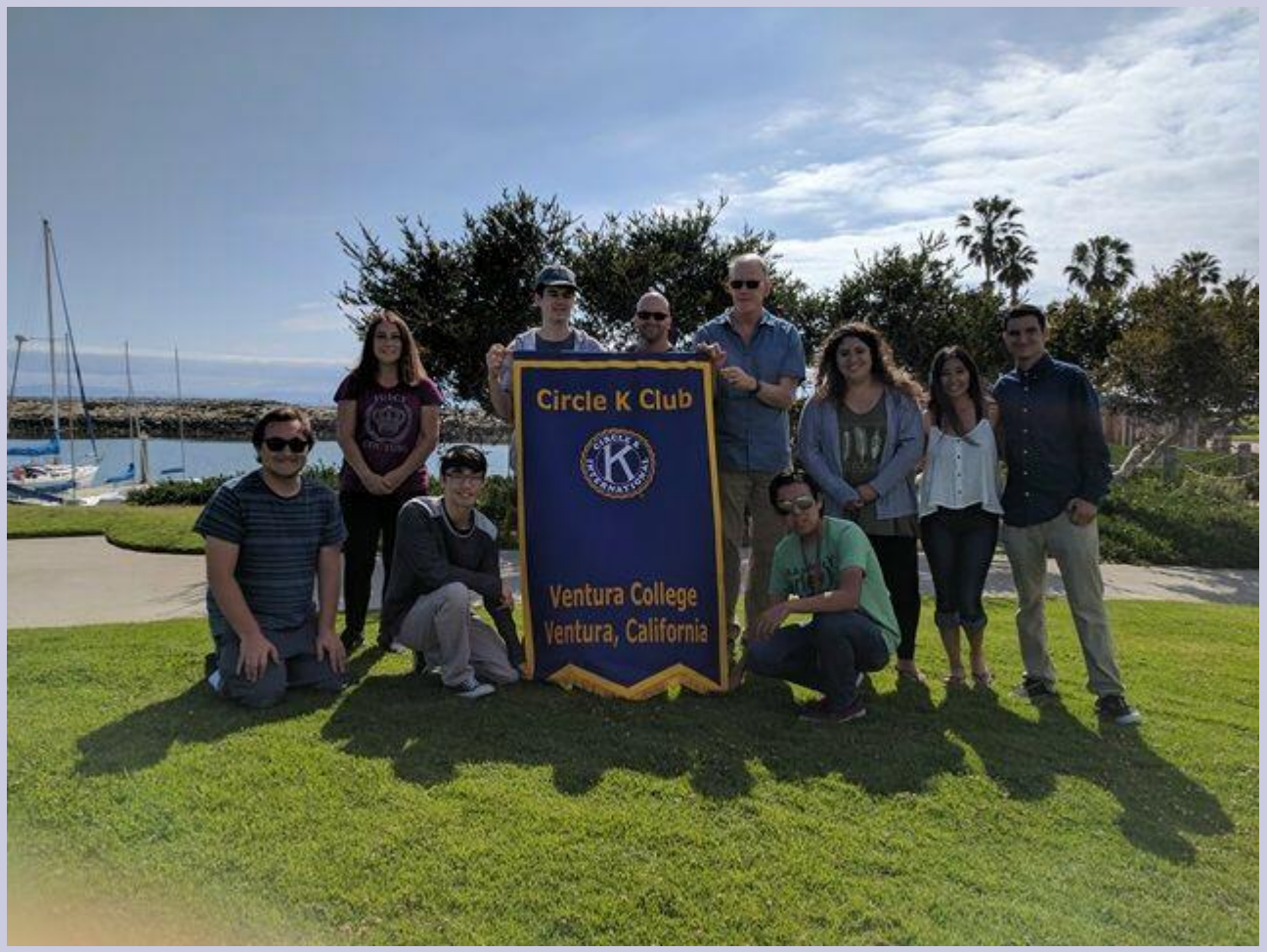
Ventura Kiwanis Club's newest SLP to get chartered is the Circle K at Ventura College. We had a great first year with the students, seen here at the end of year BBQ.