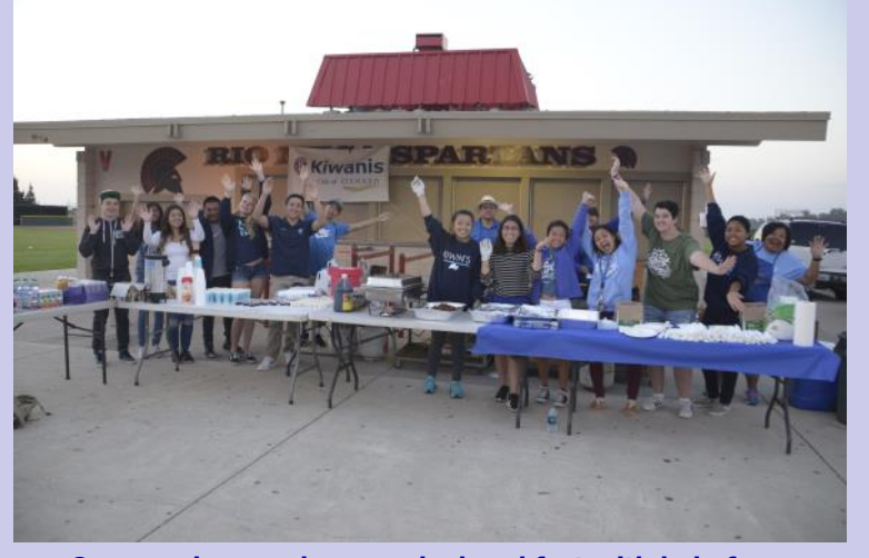
Our members make pancake breakfast with help from Channel Islands Key Club and Rancho Campana KIWIN'S.