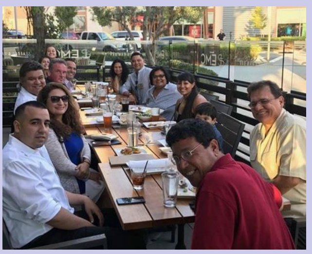
The whole gang gathers around the table.