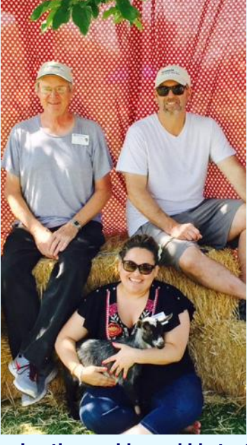
Improving the world, one kid at a time.