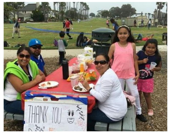
Thank You's & Smiles are always appreciated from SB Squash families!