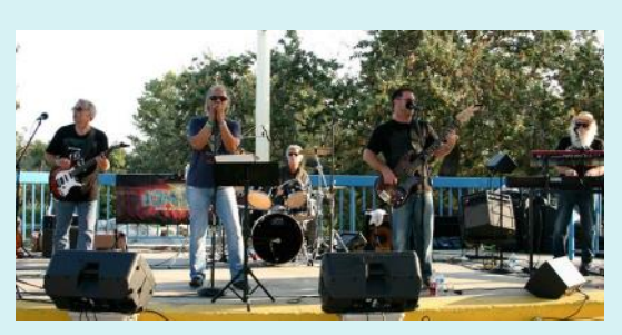
Don't miss our 6th Annual Brew Fest, August 24. Tickets: TOBrewFest.com