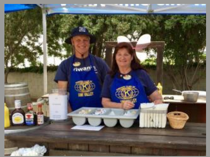
Helping out with victuals at "History Days" at Strathearn Historical Park