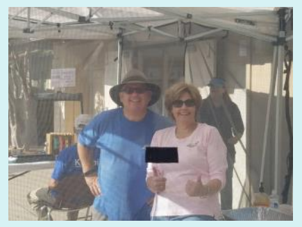
The Kiwanis Krew Serving Trip Tip Sandwiches at the Memorial Day in the Park Concert!