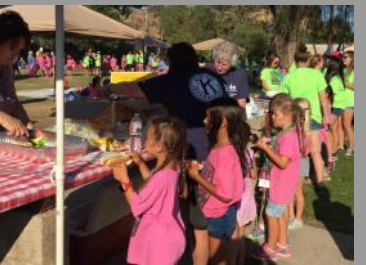
Having a BBQ cookout for the Girl Scouts. We had a great time!