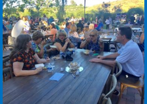
Thank you Chatsworth Kiwanians for joining us!