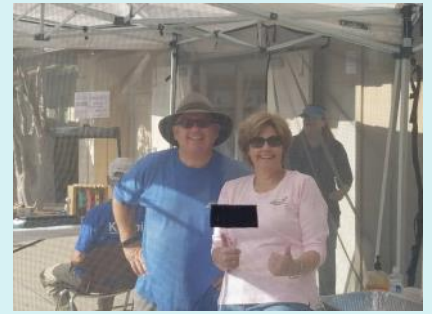
The Kiwanis Krew Serving Trip Tip Sandwiches at the Memorial Day in the Park Concert!