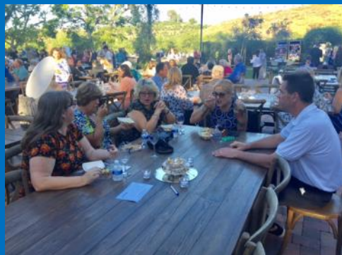
Beautiful venue at Walnut Grove in Moorpark.