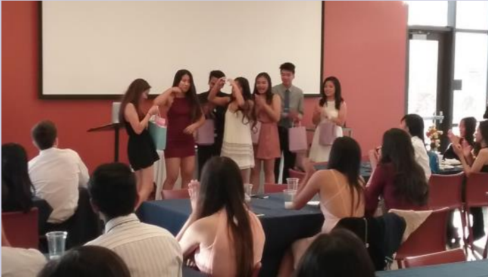
Outgoing officers receive their "thank you" packages.