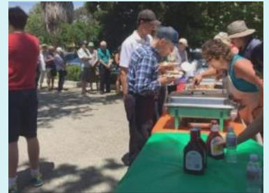
Kiwanis Club of Thousand Oaks serving lunch for Cancer Support Picnic at Wellness Center - the first event of 2 days in a row!