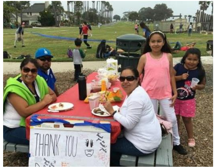
Thank You's & Smiles are always appreciated from SB Squash families!