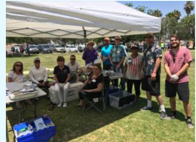
The Whole Crew