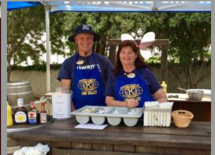
Helping out with victuals at "History Days" at Strathearn Historical Park