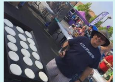
The next day, Thousand Oaks Kiwanis Club Krew does their thing at the 5K/10K Love Run for Senior Concerns, money raised to help provide Meals on Wheels for seniors.