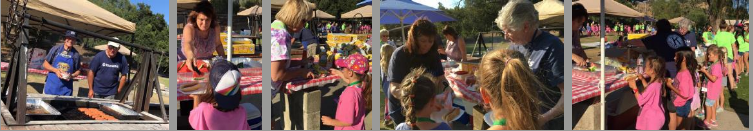
Having a BBQ cookout for the Girl Scouts. We had a great time!