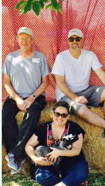
Improving the world, one kid at a time.