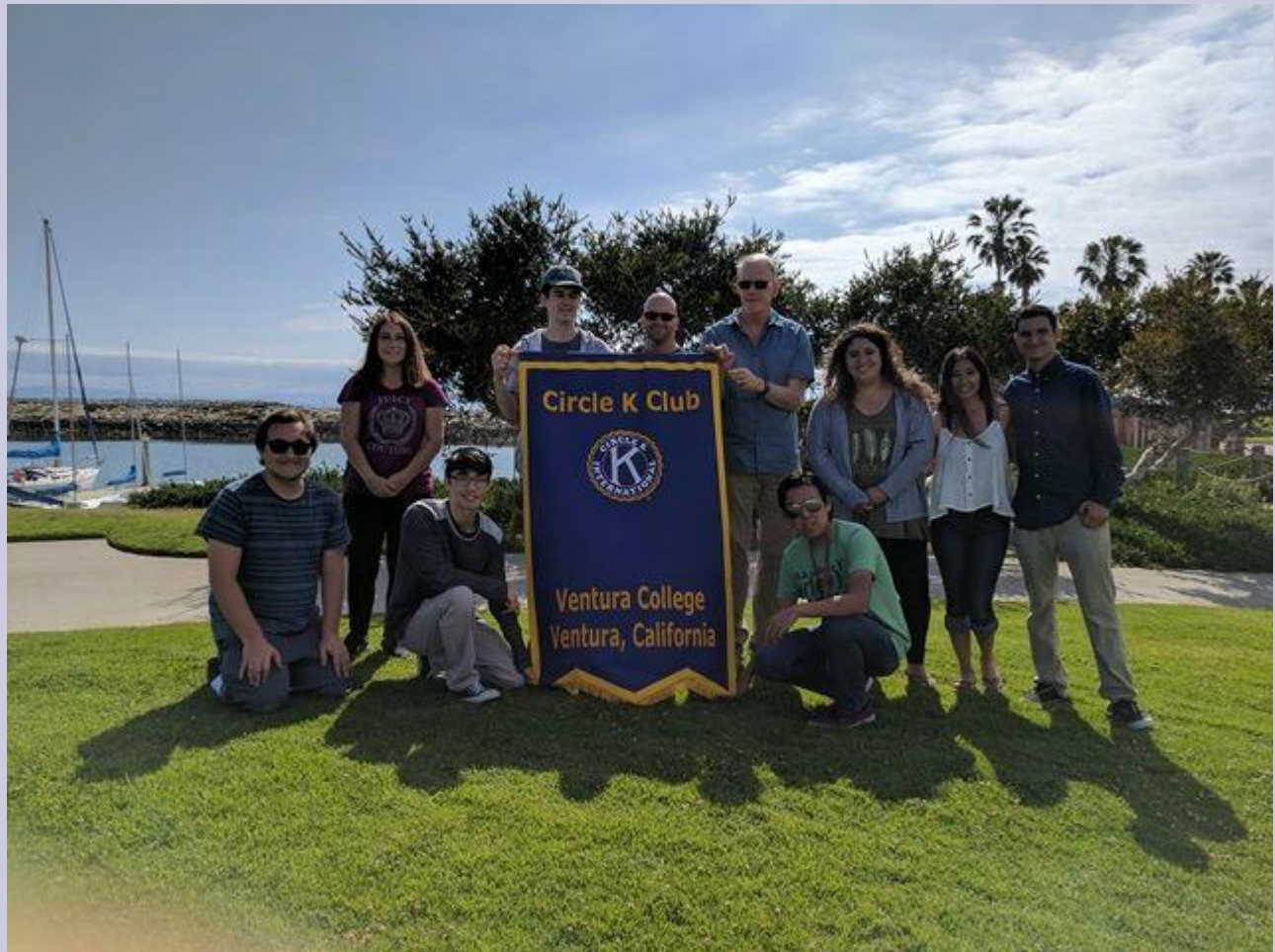
Ventura Kiwanis Club's newest SLP to get chartered is the Circle K at Ventura College. We had a great first year with the students, seen here at the end of year BBQ.