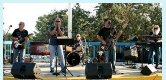
Don't miss our 6th Annual Brew Fest, August 24. Tickets: TOBrewFest.com