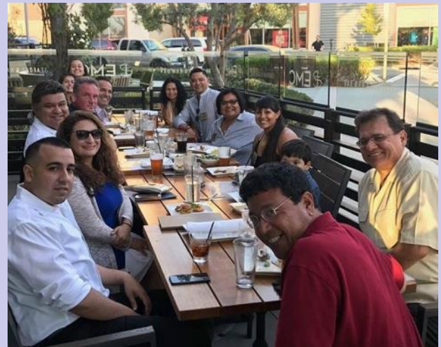
The whole gang gathers around the table.