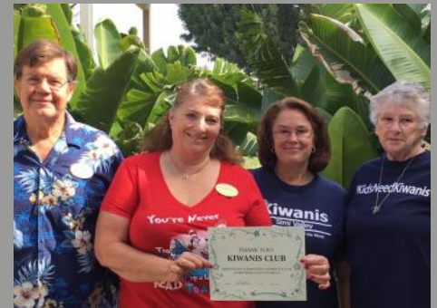
At Berylwood Elementary, Kiwanis was given a certificate of thanks for our participation in the school year! (We mentored students in the after-school Oasis Reading Room, cooked the Santa Pancake breakfast, manned the end of year bbq (below), and other events.) Thank you, Berylwood!