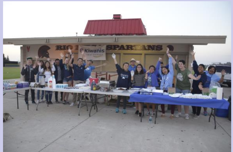
Our members make pancake breakfast with help from Channel Islands Key Club and Rancho Campana KIWIN'S.