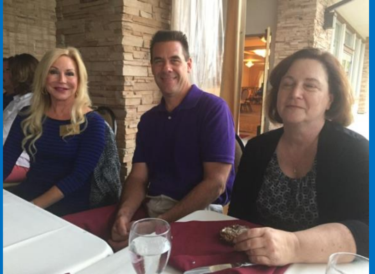
Moorpark Kiwanians enjoy a lovely dinner at the Moorpark Country Club for our monthly social.