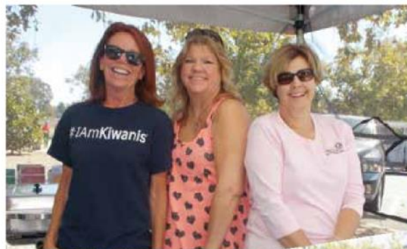
One of our gratifying events...Thousand Oaks club sets up and serves hamburgers and hot dogs to all the folks working to clean up the Ventura county beach areas.