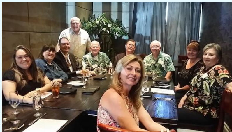
On September 15, we had our first joint meeting with our satellite club, Agoura Hills-Westlake.