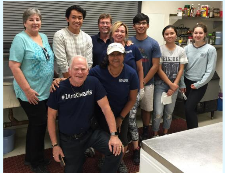
On September 22, at the Presbyterian Church on Camino Manzanaras, we served a dinner for 35 people for the Lutheran Social Services Meal and Shelter Program. Four members of the Newbury Park High School Key Club joined us.