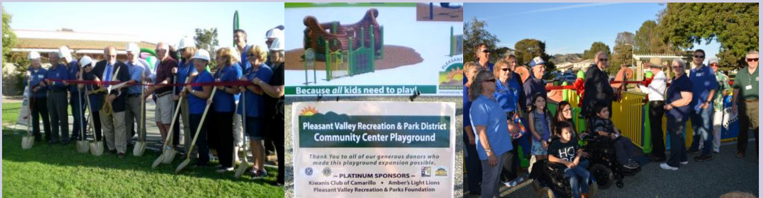
We finally broke ground for our dream project in September, with the ribbon-cutting on November 18.