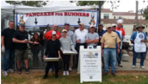
The cooks and servers getting ready for action.

Camarillo Kiwanis working alongside Thousand Oaks Kiwanis providing a pancake breakfast to all the runners and anyone else that looks hungry.