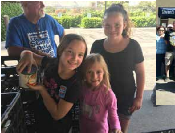
Our honorary members