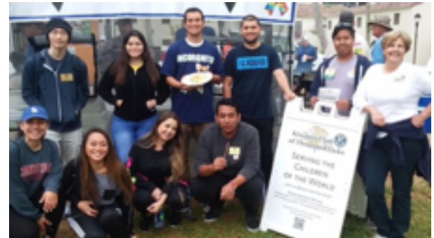
CSUCI Circle K club