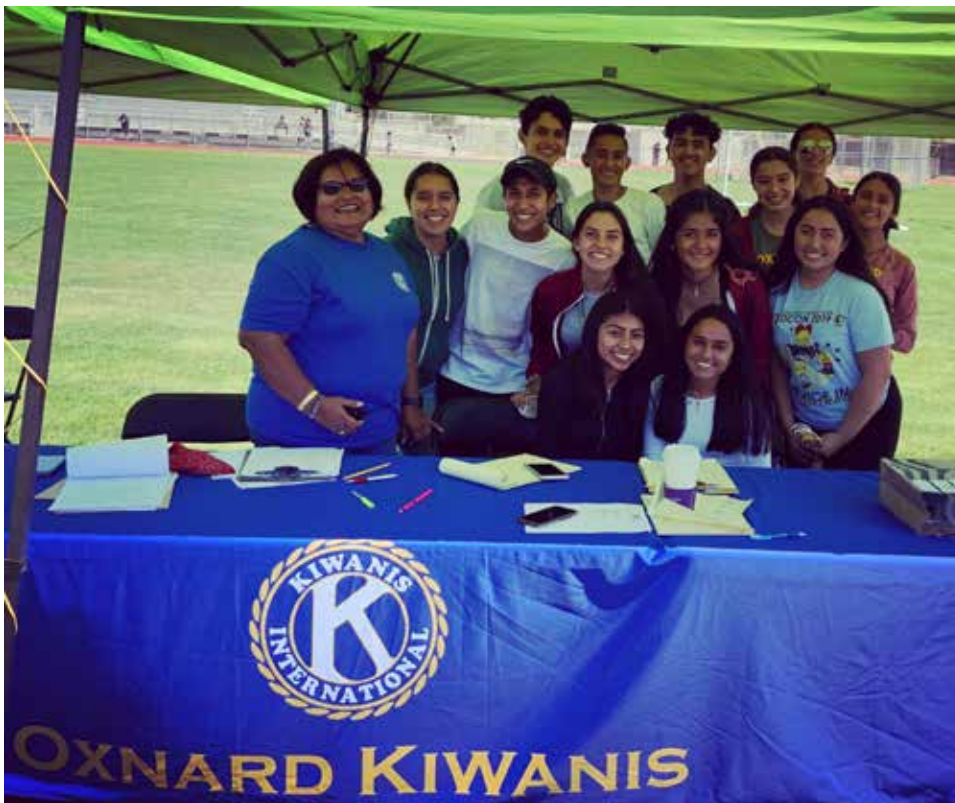
Track meet may 11 Oxnard with Key club from Oxnard high school