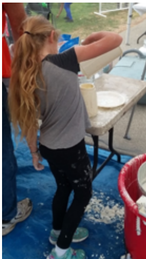
One of our helpers. It did not look like a messy job, but she proved me wrong. We told her not to get too close to the griddles as she may end up as one of the pancakes.