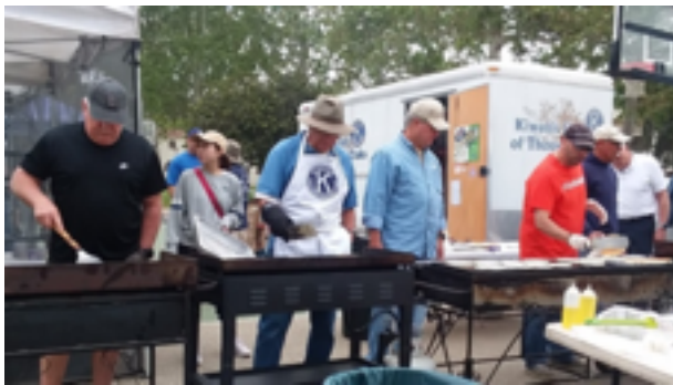
You have heard of a drum line; this was the griddle line.