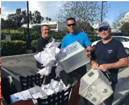
Moorpark Kiwanians, family and friends volunteered to collect, sort and shelf food items at the Moorpark Pantry Plus. Donations were collected by the United States Postal Service for their "Stamp out Hunger" campaign.