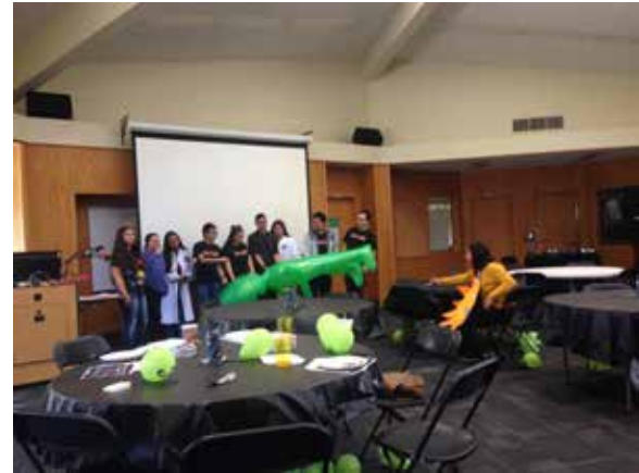
Ventura College CKI year-end party