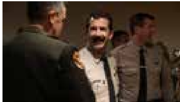
Ventura Kiwanis Officer of the Year Dinner