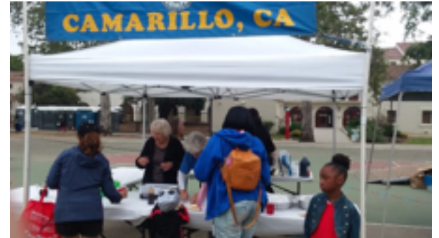
Getting the syrup and butter ready for the rush