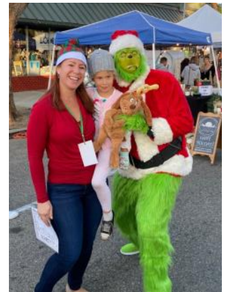
Holiday on High Street was a huge success! Our members volunteered at this family fun event... including The Grinch!