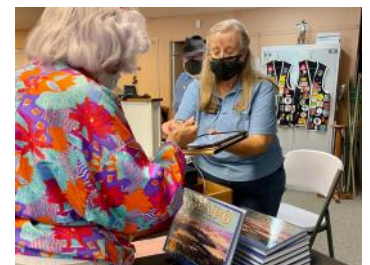
Several members serve as docents at Strathearn Historical Park and helped with the gala Holiday Open House.