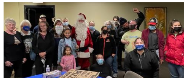
The Simi-Su Aktion Club meeting included a visit from Santa and caroling.