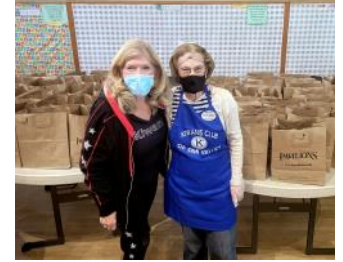
Simi Kiwanians helped the Rotary Club prepare their annual Thanksgiving Dinner for Seniors - to go this year!