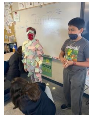
Builders Club members brainstorming with post-its. Ok, so we probably would have stuck them on the whiteboard. But they are so much more inventive and made it a lot of fun.

We will be dark the last two Tuesdays in 2021 and will start back live on Jan. 4, Noon, at the Sportsman Restaurant.