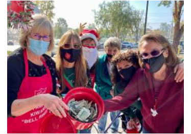
Our Salvation Army Bell Ringers sang and rang their way to the highest one-day collection recorded at our site.