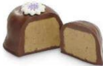
Peanut Butter Egg An irresistible treat. 3 oz $8.50 #9499