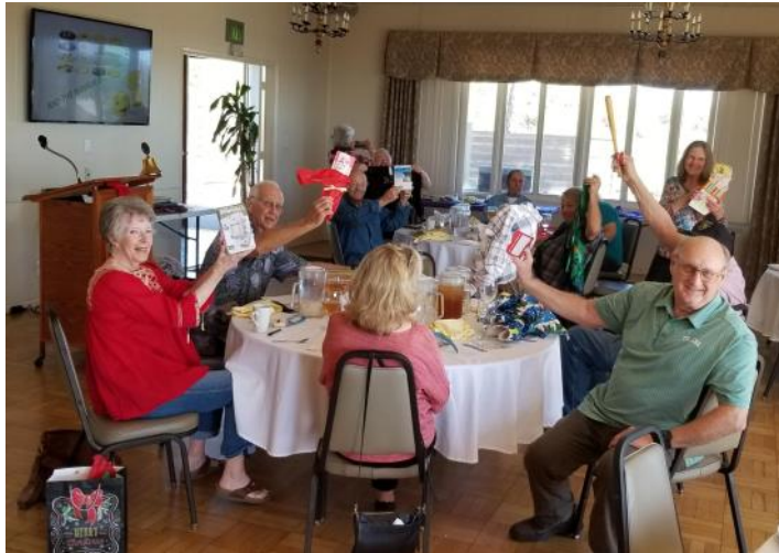
Kiwanians from Ventura show their treasures from the club's white elephant gift exchange in February.