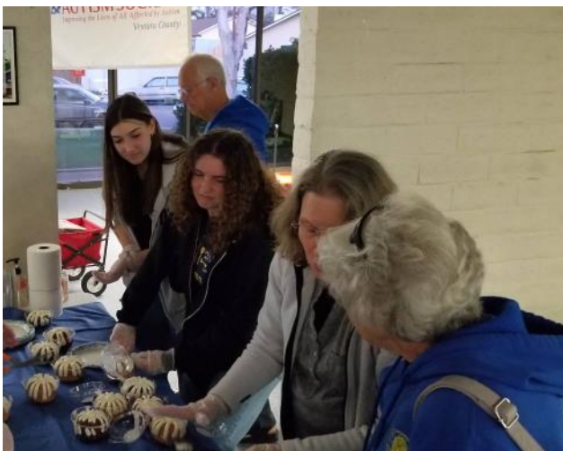
Members of both the Ventura Kiwanis and the Ventura High School Key Club prepare desserts for the March DCM.