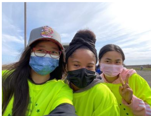
Key Club and KIWIN'S members at Seaside Marathon, Ventura