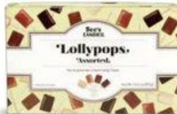
Assorted Lollipops Vanilla, Butterscotch, Café Latté and Chocolate. Approximately 30 lollipops. 1 lb 5 oz $27.00 #296