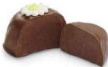
Chocolate Butter Egg Creamy and delicious. 3 oz $8.50 #9500