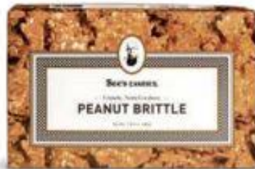
Peanut Brittle Buttery, crunchy and irresistible. 1 lb 8 oz $27.00 #355