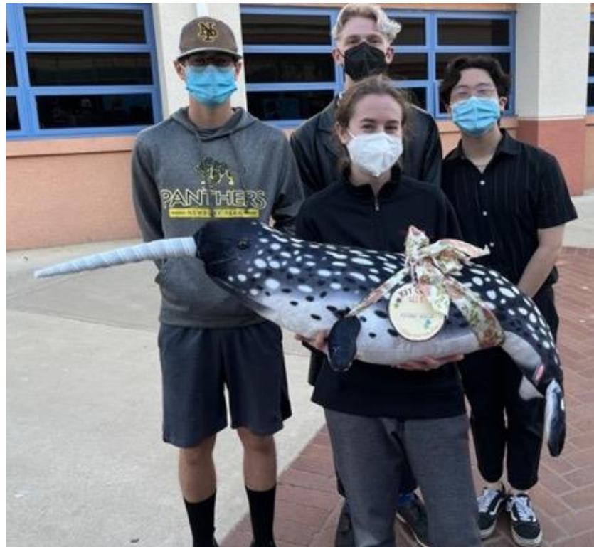
Division 42 East's Mighty Narwhal mascot in the loving care of the Newbury Park High School Key Club