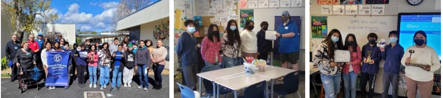
University Preparation Charter School Builders Club celebrating their Charter Day