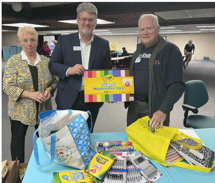
At the DCM on March 10, we presented a check for $800 to help purchase TVs for the kidSTREAM building and contributed school supplies to support homeless kids in programs at Noah's Anchorage in the Santa Barbara area and School on Wheels in the Ventura area.