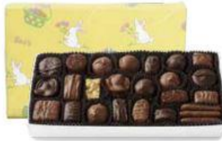
Assorted Chocolates Milk and dark decadence. Delivered in seasonal wrap. 1 lb $26.50 #40318