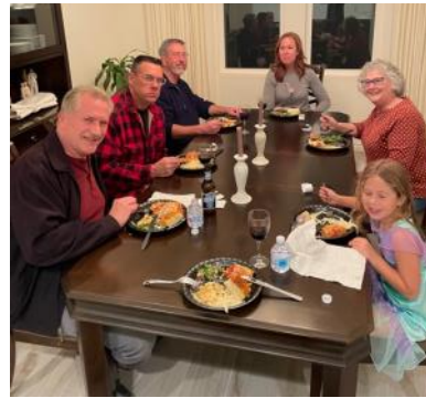
Fun, fun, fun!