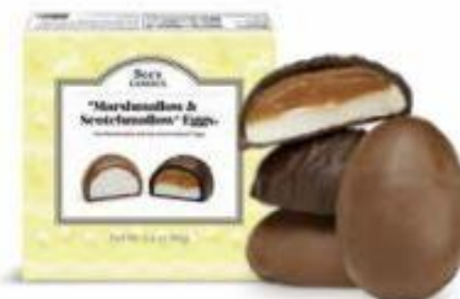
Marshmallow & Scotchmallow® Eggs One box, four yummy eggs. 3.4 oz $8.50 #9493

It's time to order Sweets for all of the SWEETIES on your list. Deadline to order is March 31. We will deliver to your Simi Valley or Moorpark address FREE. Candy is the SAME PRICE AS THE STORE and all proceeds benefit kids in Simi Valley through a variety of Scholarships! It's a Win - Win! Order Here