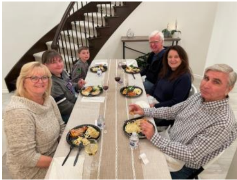
Great food, great friends.