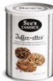
Toffee-ettes® Crunchy toffee, milk chocolate and almonds. 1 lb $26.50 #316