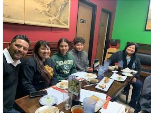
Our February general meeting was held at Sushi-Ichi 805 in Port Hueneme and included Key Club members.