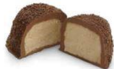
Bordeaux™ Egg A tasty classic. 3 oz $8.50 #9501