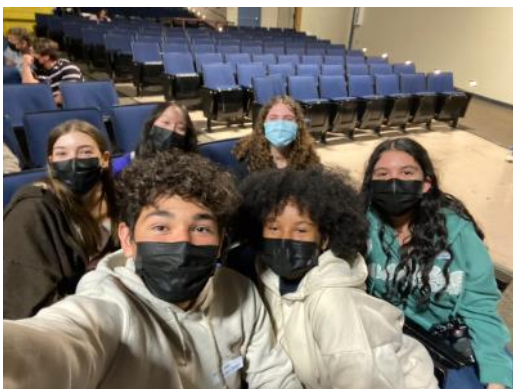
Key Club Div. 42 East & West Conclave at Oxnard High School