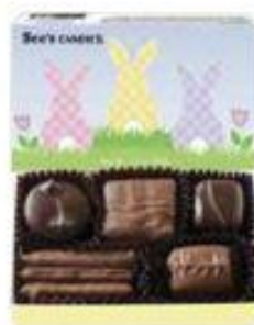
Hoppy Surprise Box Full of See's favorites. 3.5 oz $9.50 #8093