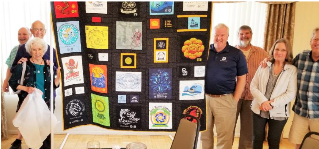
In March, some creative members unveiled a quilt that represents the years of the "Cool Breeze" bike ride, an annual summer event that the Kiwanis Club of Ventura has organized for over 20 years.