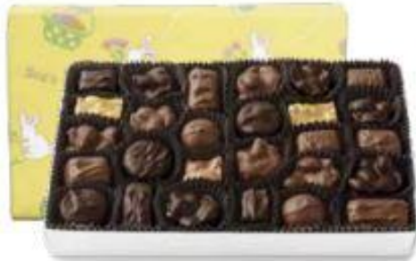
Nuts & Chews Yummy, crunchy and chewy. Delivered in seasonal wrap. 1 lb $26.50 #40334