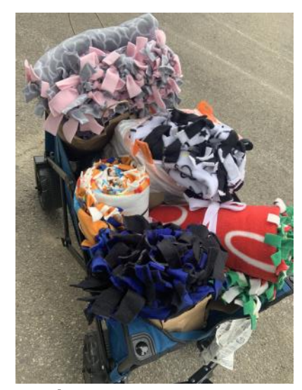
Oxnard Kiwanis donated a few more no-sew blankets to the Ventura County Foster Care program.