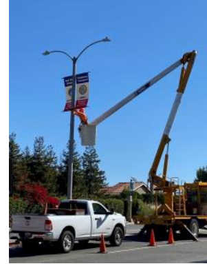
The next round of the Moorpark Military Banners has been installed on Tierra Rejada. Our club is in charge of this awesome tribute to our active military members.