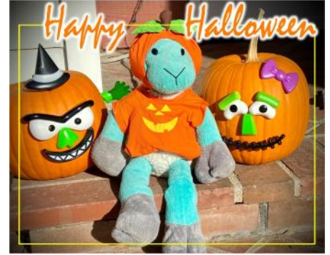
Holiday greetings from our club mascot, Lazlo!