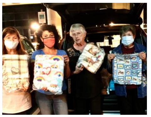
Our members are donating diapers and wipes for the Samaritan Center, our local homeless shelter. Our first delivery totaled 20 diaper and 19 wipes packages. We're also still making blankets for foster kids.