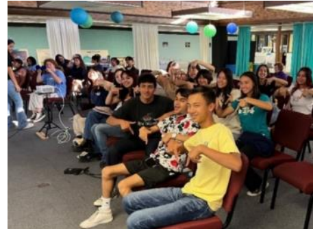
Business part of the meeting getting underway