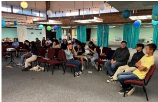
Mixed up teams starting trivia