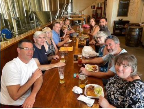
Our whole happy group!

Cheers! Our August Social Meeting was held at Enegren Brewing Company