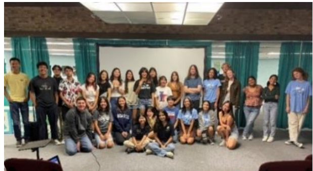
Photo shoot at the end of the evening

On the last Thursday of August, we set up an Information Booth at Camarillo House during their Food Truck Fundraiser. We had lots of giveaways for kids, and we had information about our club activities on display. Unfortunately, we did not have too many inquiries about Kiwanis, but we did give out a lot of emergency stickers for kids' car seats. On the brighter side, it did give us time to enjoy some great country music from Caught Red Handed and enjoy some food from the many trucks that were there.