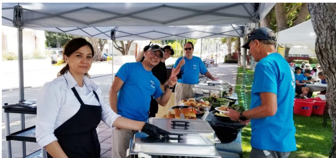
A fun time was had by all at Kiwanis Club of Ventura's Cool Breeze Century bike ride, held on August 20.