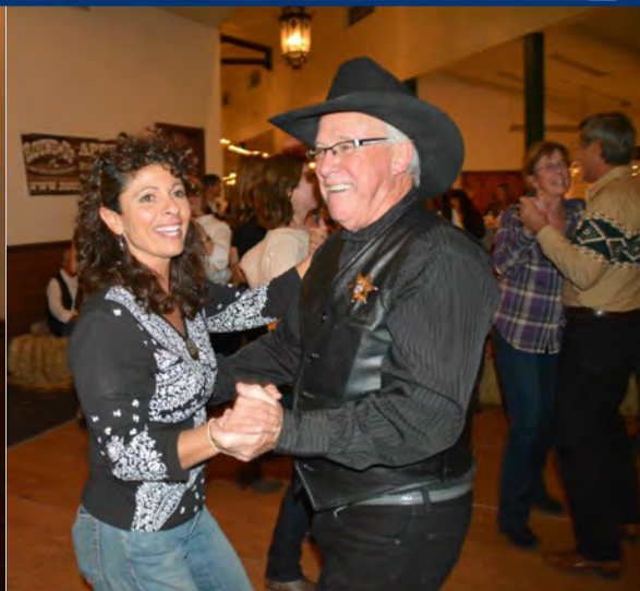
On November 13, we held the 2nd Annual Black White & Blue Jeans Dance at the Ranch with over 500 people in attendance.