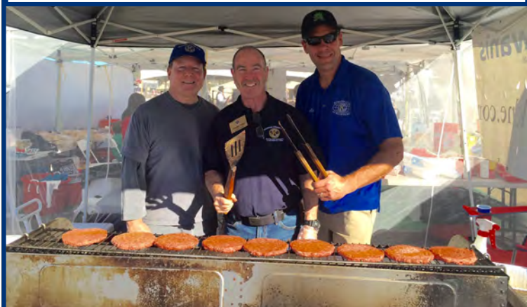
Moorpark Kiwanians are sizzling hot as we grill and serve burgers and dogs at The Blue and The Gray Civil War Reenactment.