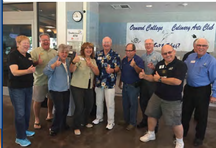
On November 21 we attended the RTC.