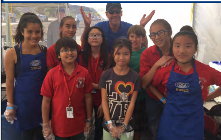
Student from Builders Club and Lawrence Middle School Leadership class help serve at the Kiwanis food booth.