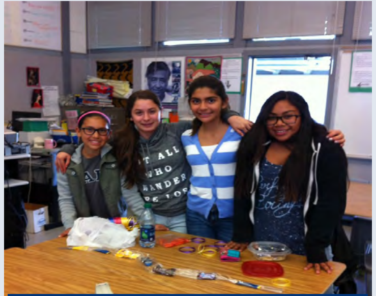
Builders Club at Anacapa Middle School work on Holiday Project