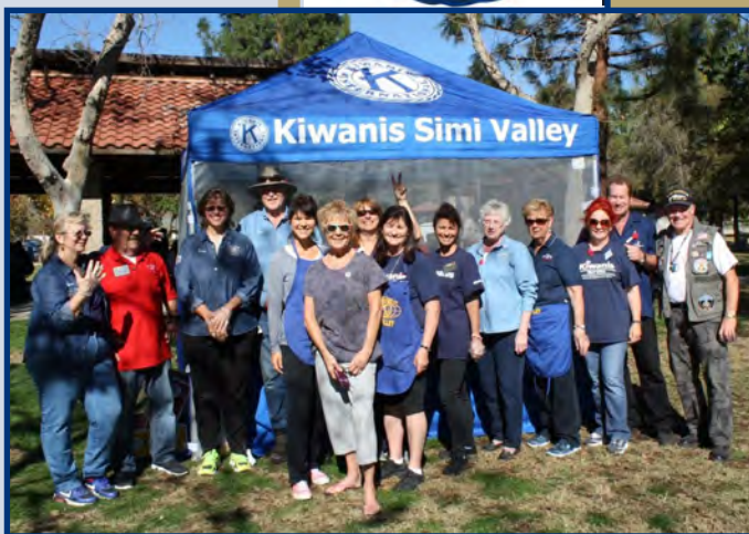
On November 11 we served lunch to over 330 Veterans.