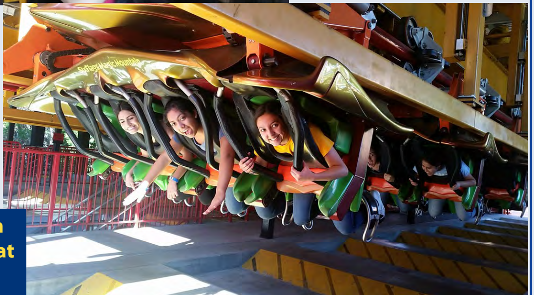
Key Club having fun at Magic Mountain at Fall Rally