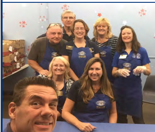
Winner winner chicken dinner. Moorpark Kiwanians serve a delicious dinner at the DCM!