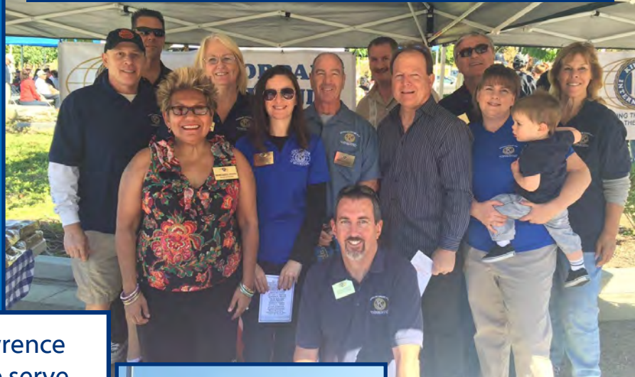
Honoring our Veteran's at the Moorpark Veteran's Day Observance.