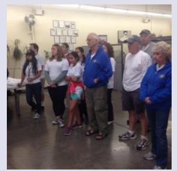
Ventura Kiwanis Club spends Kiwanis One Day at the ARC of Ventura County to help prepare walls for painting, wash vans and clean the kitchen.