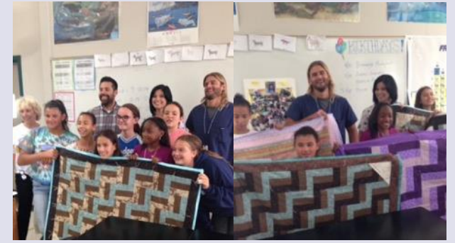
DATA Builders Club donate quilts they made to Ventura County Medical Center Cancer Treatment Center. Two nurses from the chemotherapy center graciously accept the quilts on behalf of their patients.