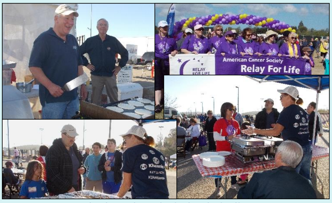
Kiwanians cook pancakes for the Relay for Life.