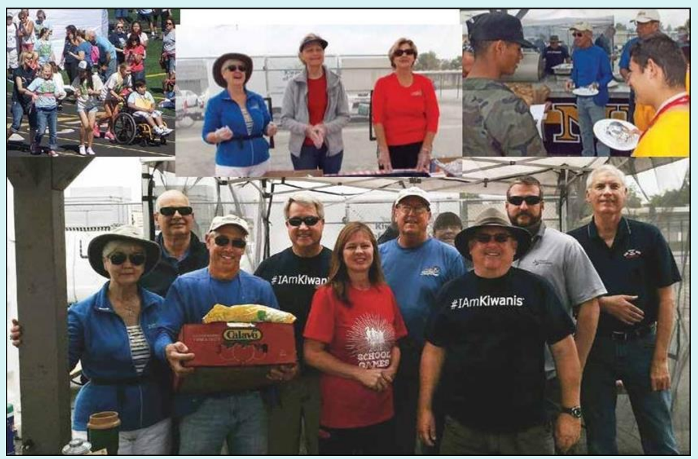
T. O. Kiwanians cooked hamburgers for the Special Olympics Track Meet at Newbury Park High School.