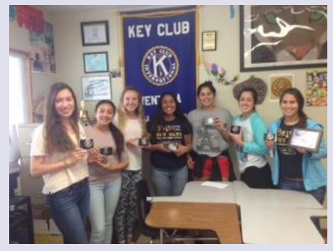
Ventura High Key Club members proudly accept Academic Medallions to wear at graduation.