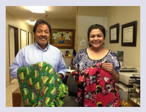
Anacapa Builders Club made quilts which were donated to Tri-County Family Services for children in need.